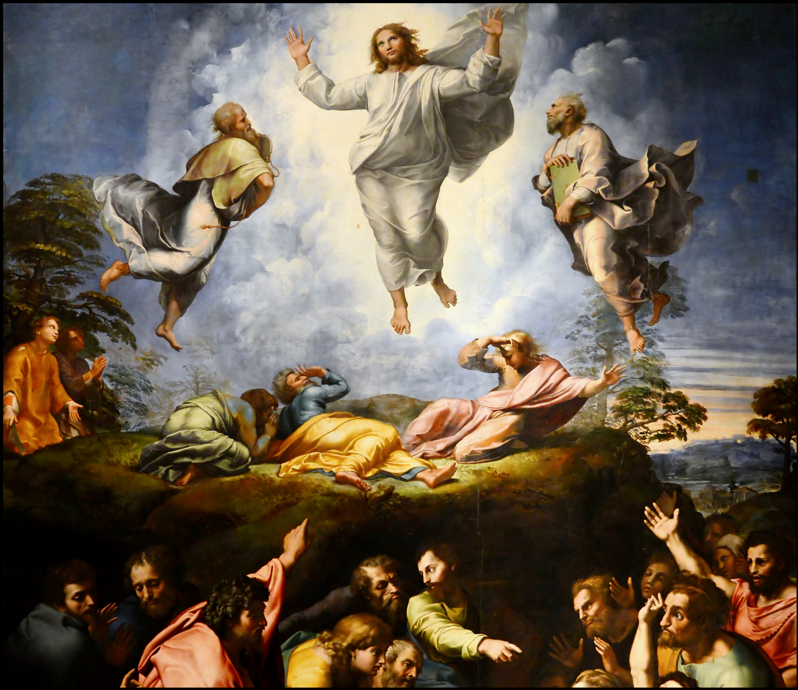
The Transfiguration Raphael 1483-1520