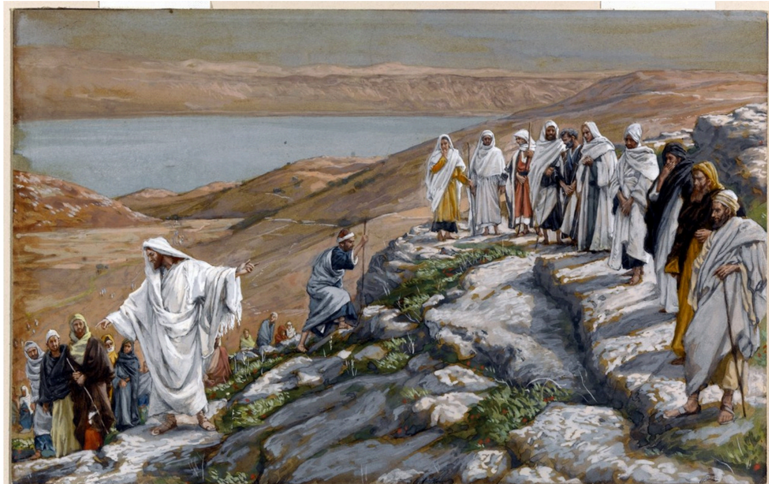
Christ Sending Out the Seventy Disciples, Two by Two James Tissot, 1890