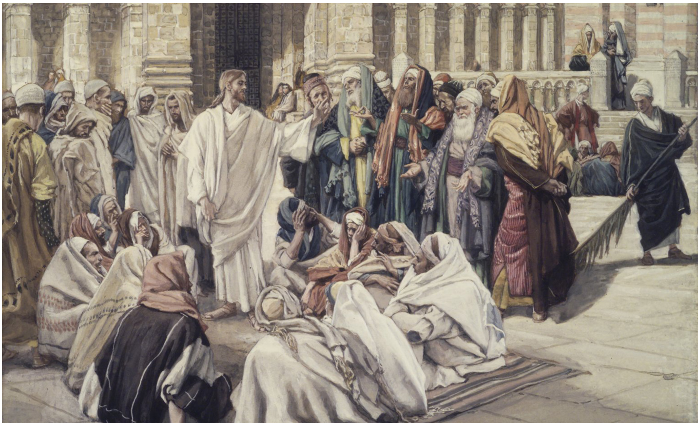
"The Pharisees Question Jesus" by artist James Tissot circa 1890 - European Art Collection

We, the faith community of Sacred Heart of Jesus Catholic Church, in striving to be like Christ, are committed to living the Gospel by participating in the Sacraments, promoting spiritual growth and religious education, and being an example of His Eucharistic love to all.