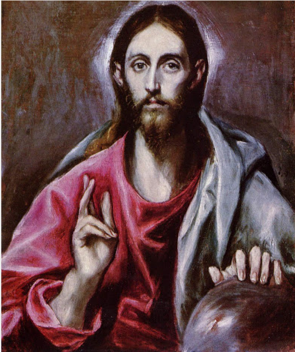
Salvator Mundi / Christ Saviour of the World By El Greco (1595–1600)

July 7, 2024 Fourteenth Sunday of Ordinary Time