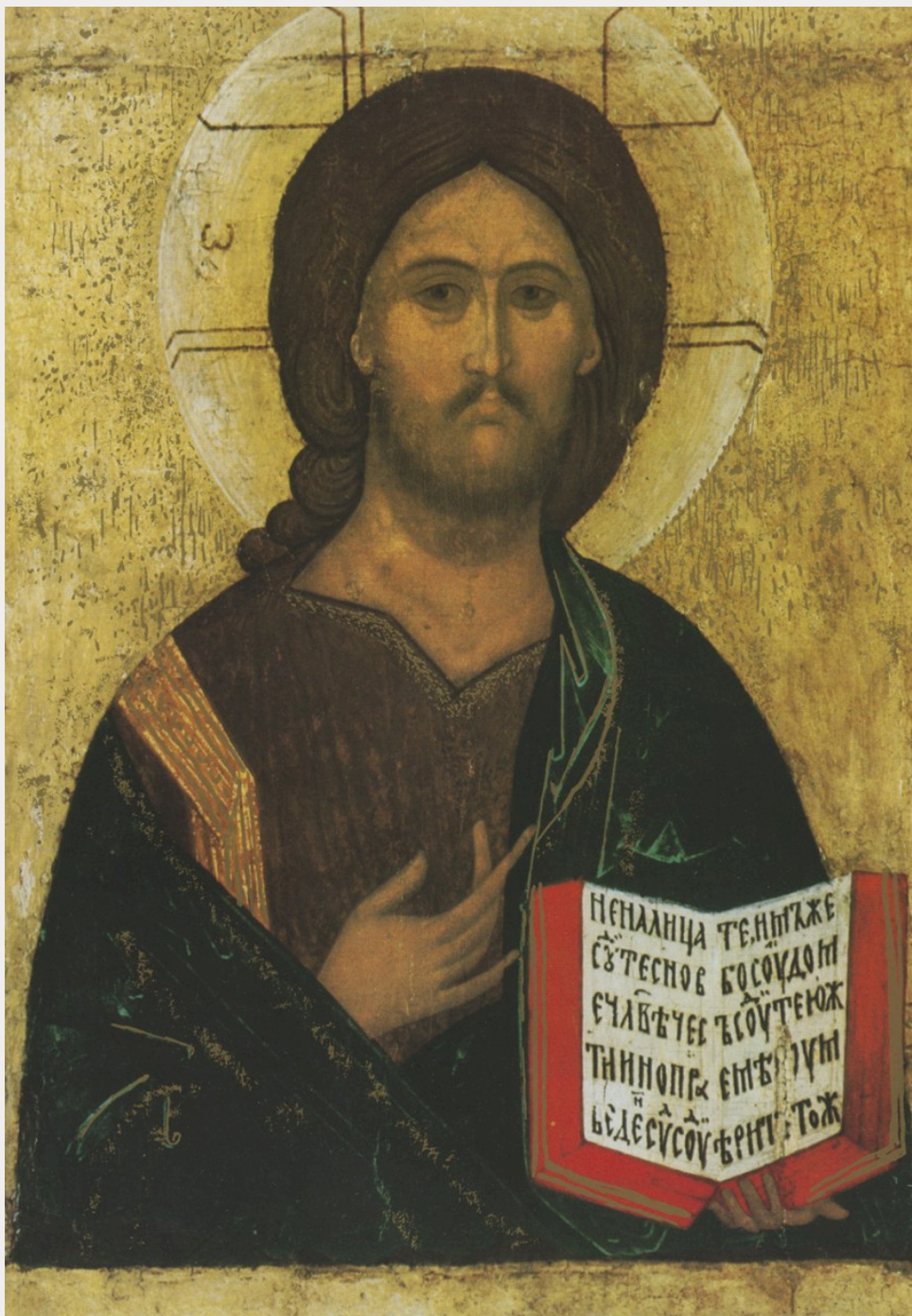
Christ the Teacher Icon