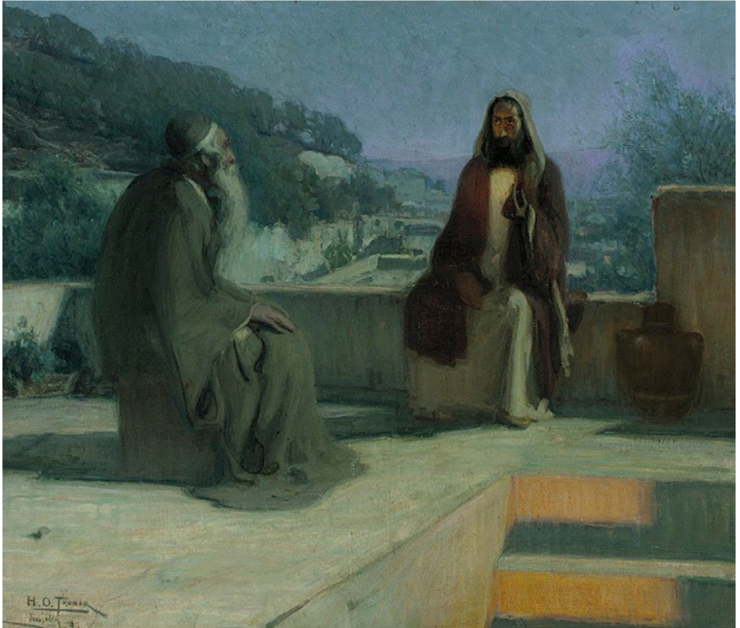
Nicodemus Visiting Christ, 1899, Henry Ossawa Tanner