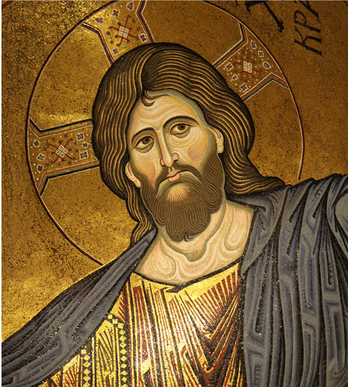
Christ Pantocrator – Basilica of Monreale, Palermo, Sicily