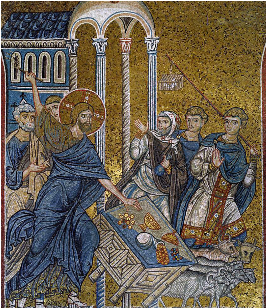
Expulsion of the merchants from the temple, mosaic. 12th and 13th centuries. Monreale Cathedral, Palermo, Sicily, Italy.