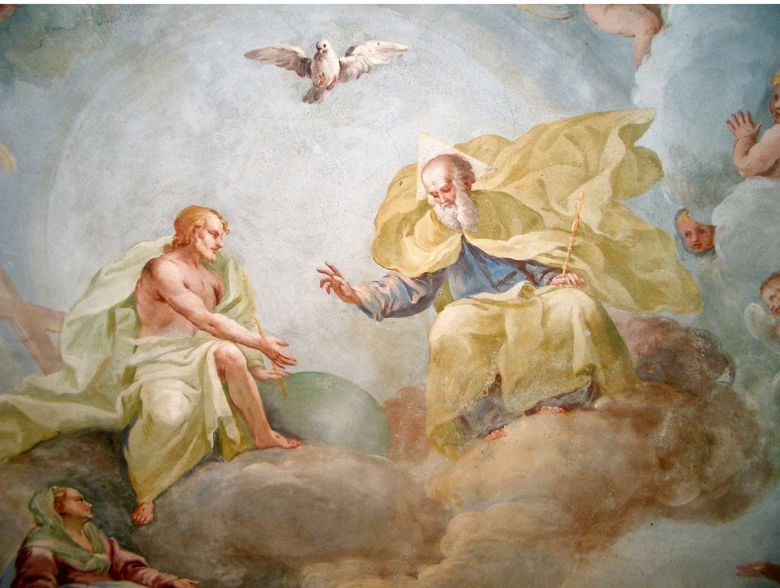
Luca Rossetti da Orta, The Holy Trinity, fresco, 1738–9, St. Gaudenzio Church at Ivrea (Torino), Italy