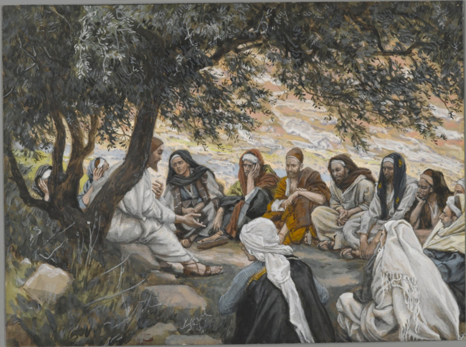
James Tissot: The Exhortation to the Apostles