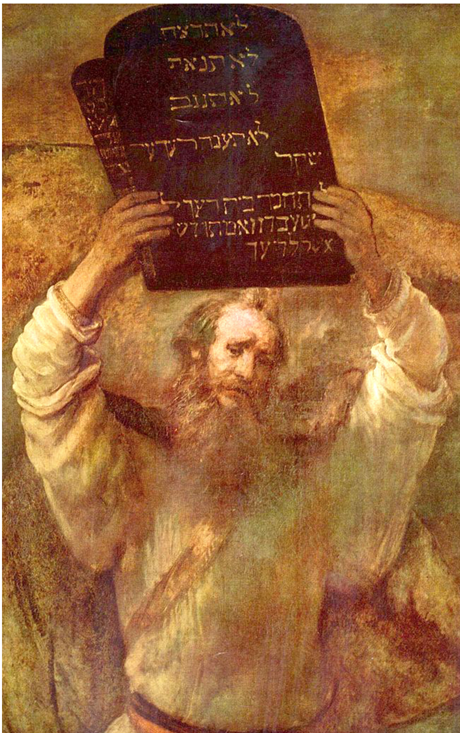
Moses With the Tablets of the Law