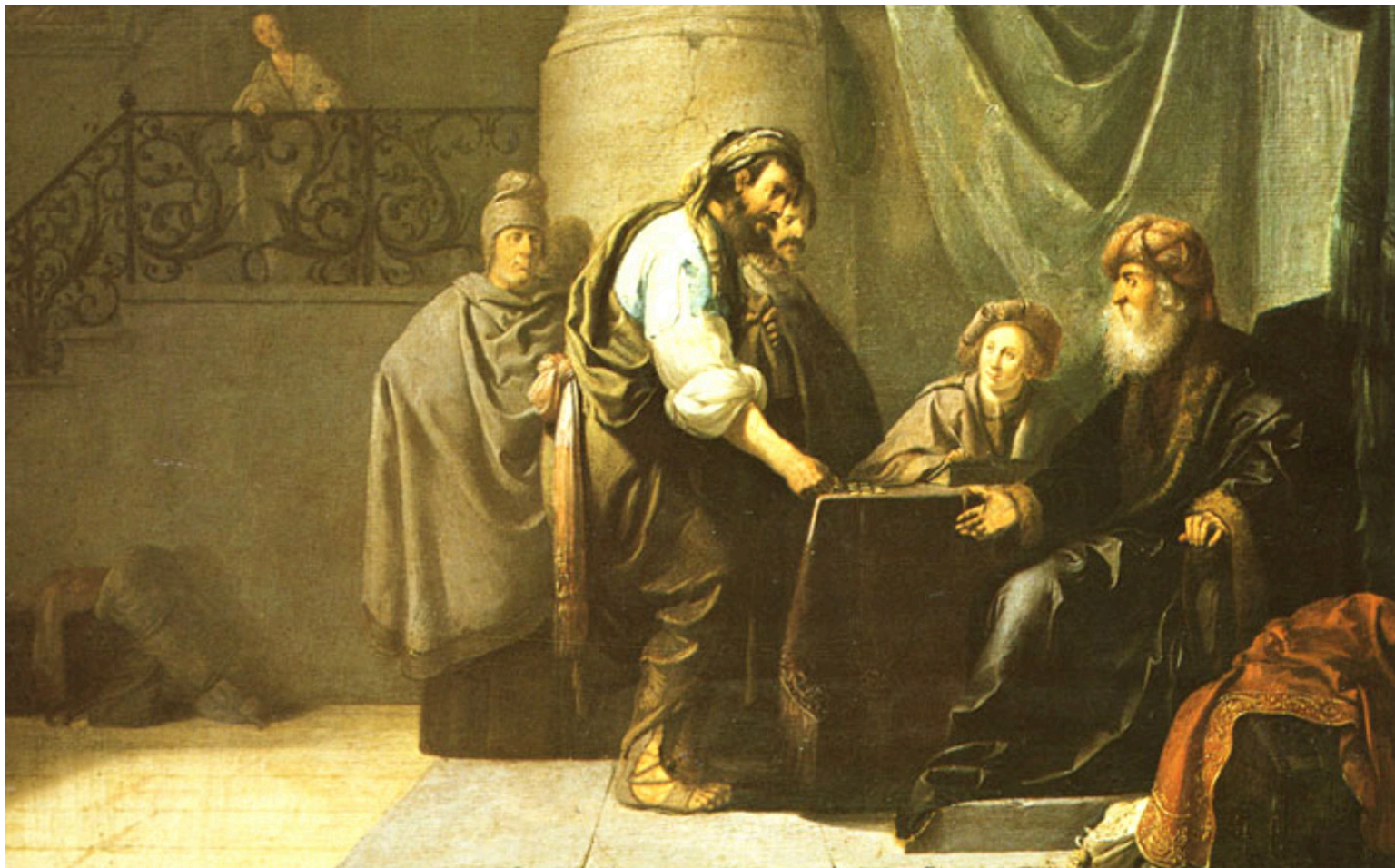
17th century painting by Willem de Poorter at the National Gallery of Prague entitled "The Parable of The Talents or Minas"