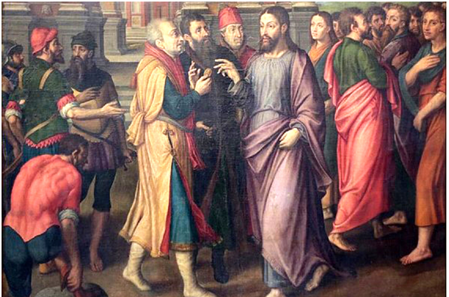
“Render Unto Caesar” — currently located in Pontevedra, Spain

by Michael de Coxien (1499-1592) Flemish painter, court painter, draughtsman and designer