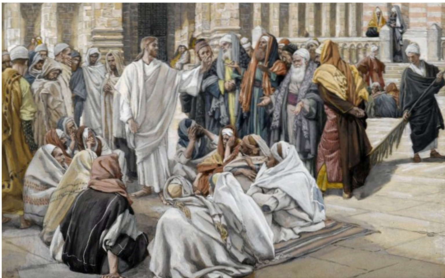
“The Pharisees Question Jesus” — currently located at the Brooklyn Museum by James Tissot (1836-1902)