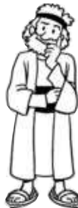
Thomas the Doubter