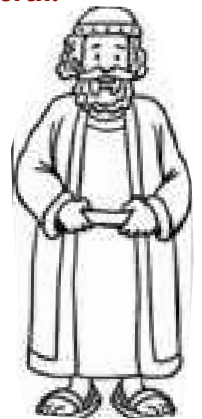
Matthew Tax Collector