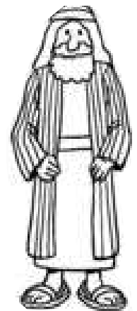
James the Lesser perhaps called lesser because he was younger or shorter than James the Greater.