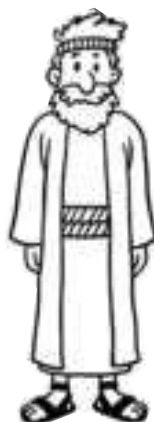
Simon the Zealot