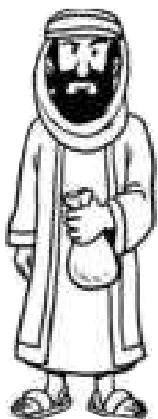
Judas Iscariot the Disciple who betrayed Jesus