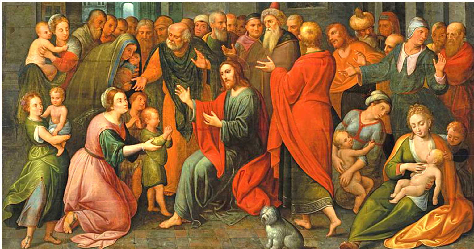
CHRIST AMONG CHILDREN at the National Museum in Warsaw by Adam van Noort (1562-1641)

We, the faith community of Sacred Heart of Jesus Catholic Church, in striving to be like Christ, are committed to living the Gospel by participating in the Sacraments, promoting spiritual growth and religious education, and being an example of His Eucharistic love to all.