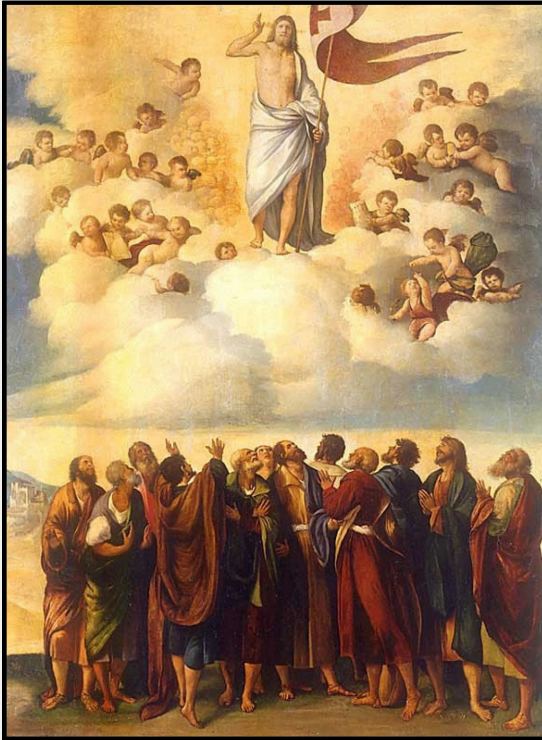
Ascensione di Cristo Pietro Perugino (1448–1523)

June 1 st , 2025 The Solemnity of Easter