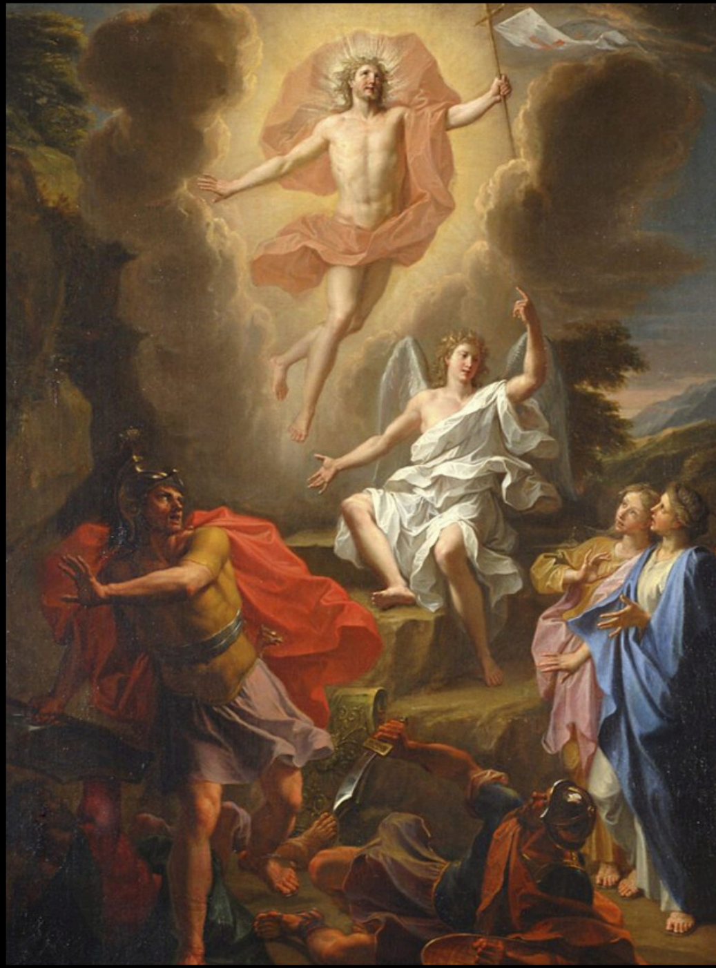
The Resurrection of Christ Noël Coypel, 1700

Easter Sunday of the Resurrection of the Lord April 5 th , 2026 Year A