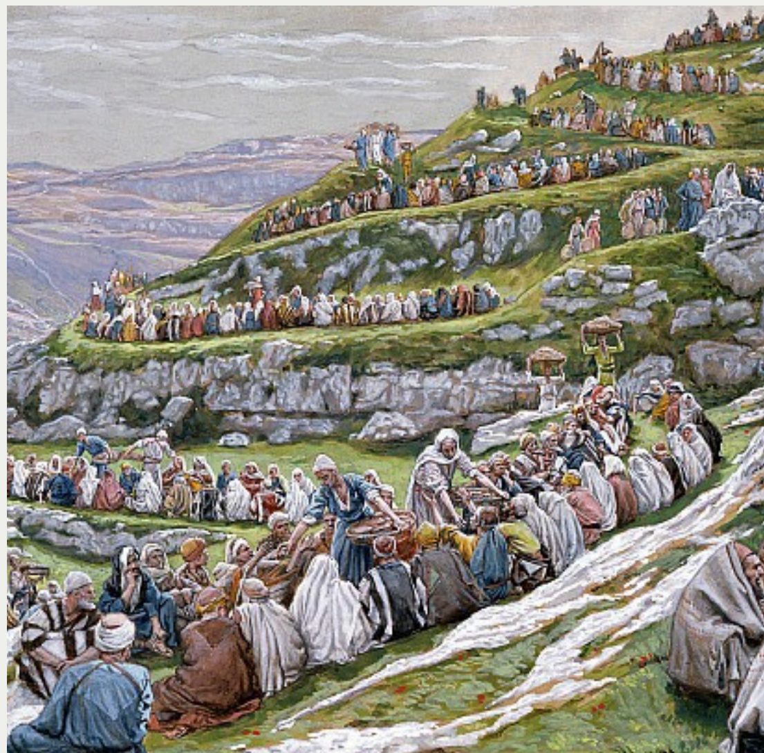
Miracle of the Loaves and Fishes James J Tissot, 1886-94