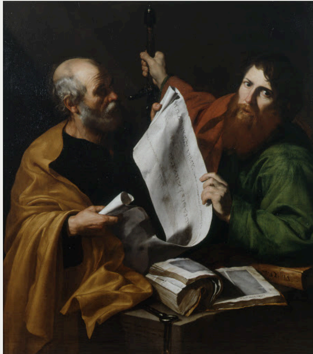
Saint Peter and Saint Paul José de Ribera