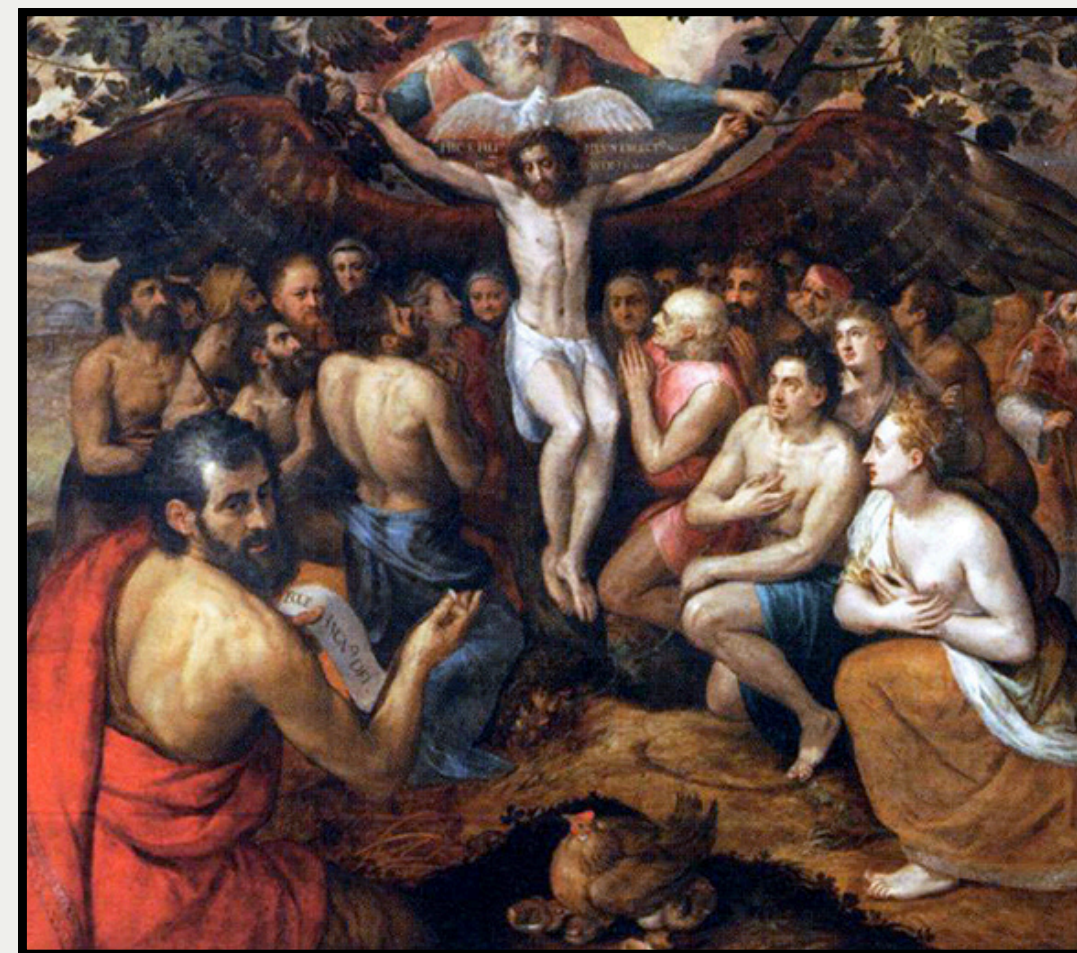
The Holy Trinity Frans Floris, 1562