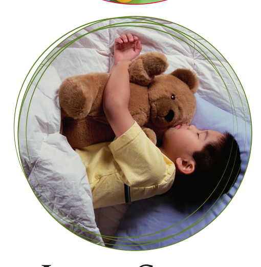
IOWA STATE UNIVERSITY