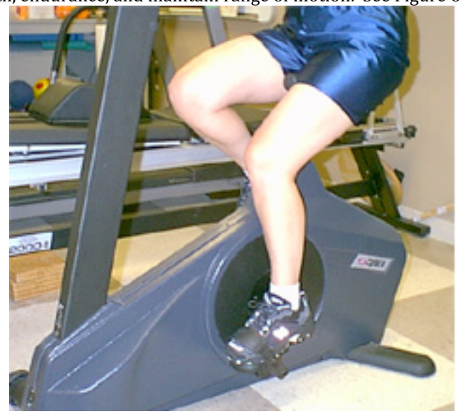
Figure 6. Stationary Bicycle helps to increase strength

Stationary Bicycle. Use a stationary bicycle two times a day for 10 - 20 minutes to help increase muscular strength, endurance, and maintain range of motion. See Figure 6