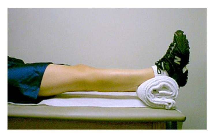
Figure 1. Heel prop using a rolled towel.