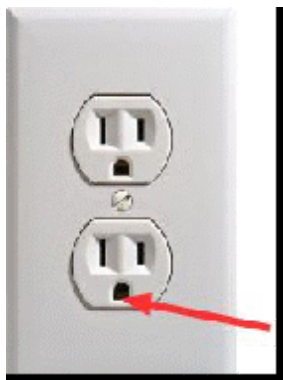
Figure 1. Ground a wire to the bottom hole in a 3-prong outlet. Use some tape to hold it in place. One method is to stick the loose end under the elastic in your underwear, or connect the ground to a piece of aluminum foil that is touching your bare skin.

It may be helpful to ground your body using the grounding in your outlets. CAUTION: Be certain you are placing the ground wire into the bottom hole, in a 3-prong outlet.