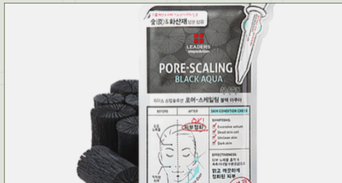
◀ Charcoal Facial Masks