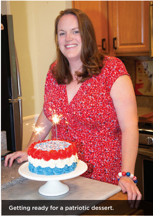
Getting ready for a patriotic dessert.