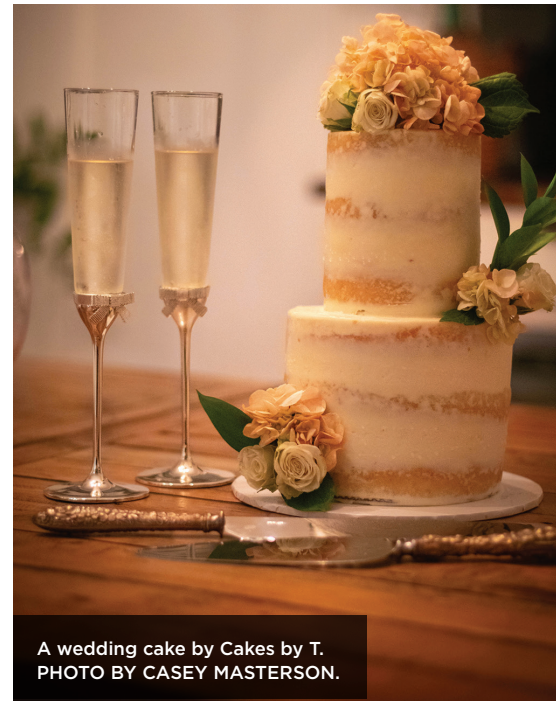
A wedding cake by Cakes by T.