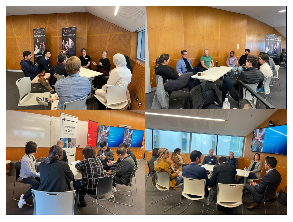
Connecting \ the \ dots: Students \ were \ split \ into \ 4 \ groups \ to \ facilitate \ mentorship: career \ development, entrepreneurship, engagement \ with \ Federal \ bodies, policy \ and \ system \ engagement