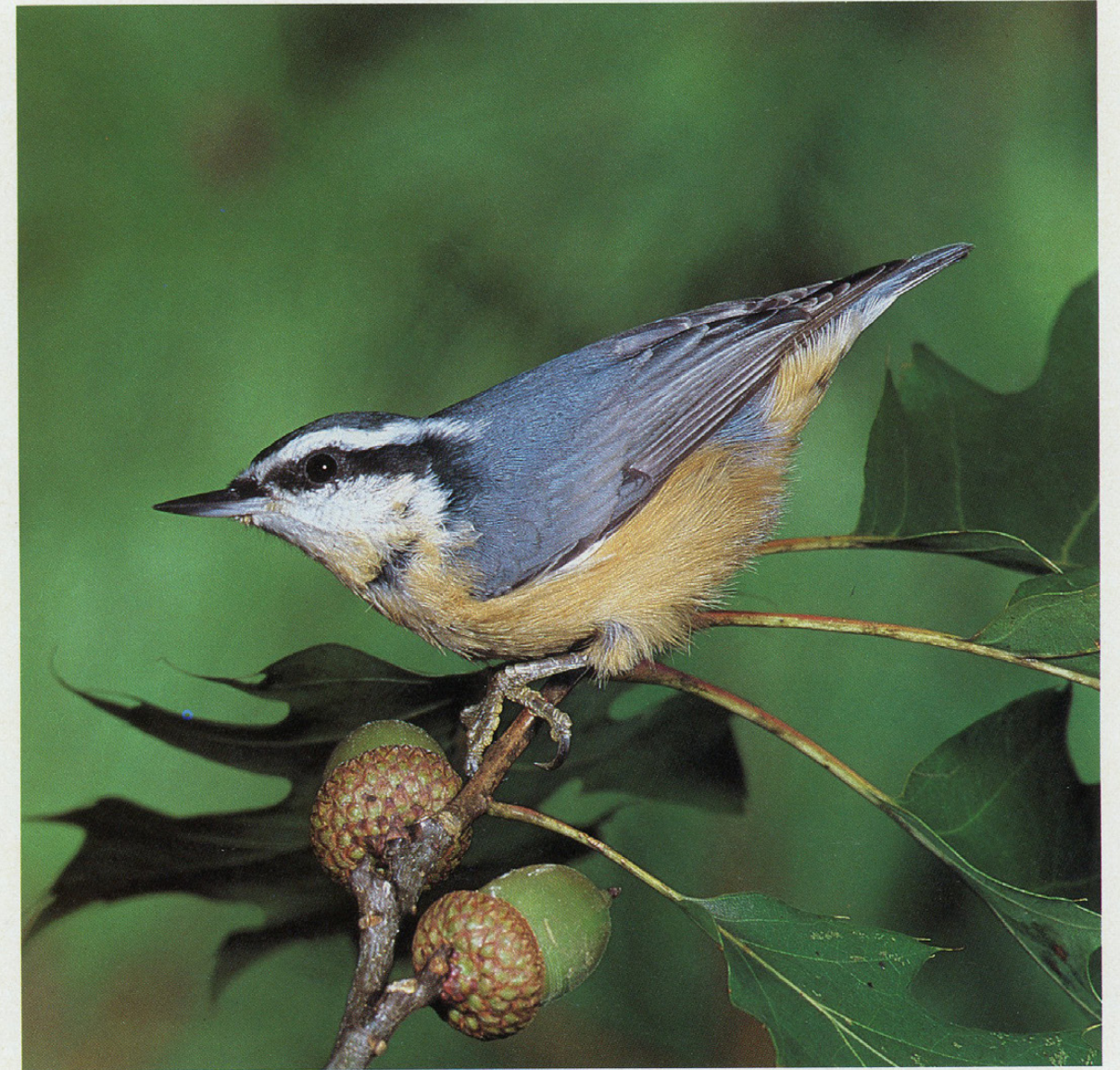
54 RED-BREASTED NUTHATCH Sitta canadensis 1981/IJ