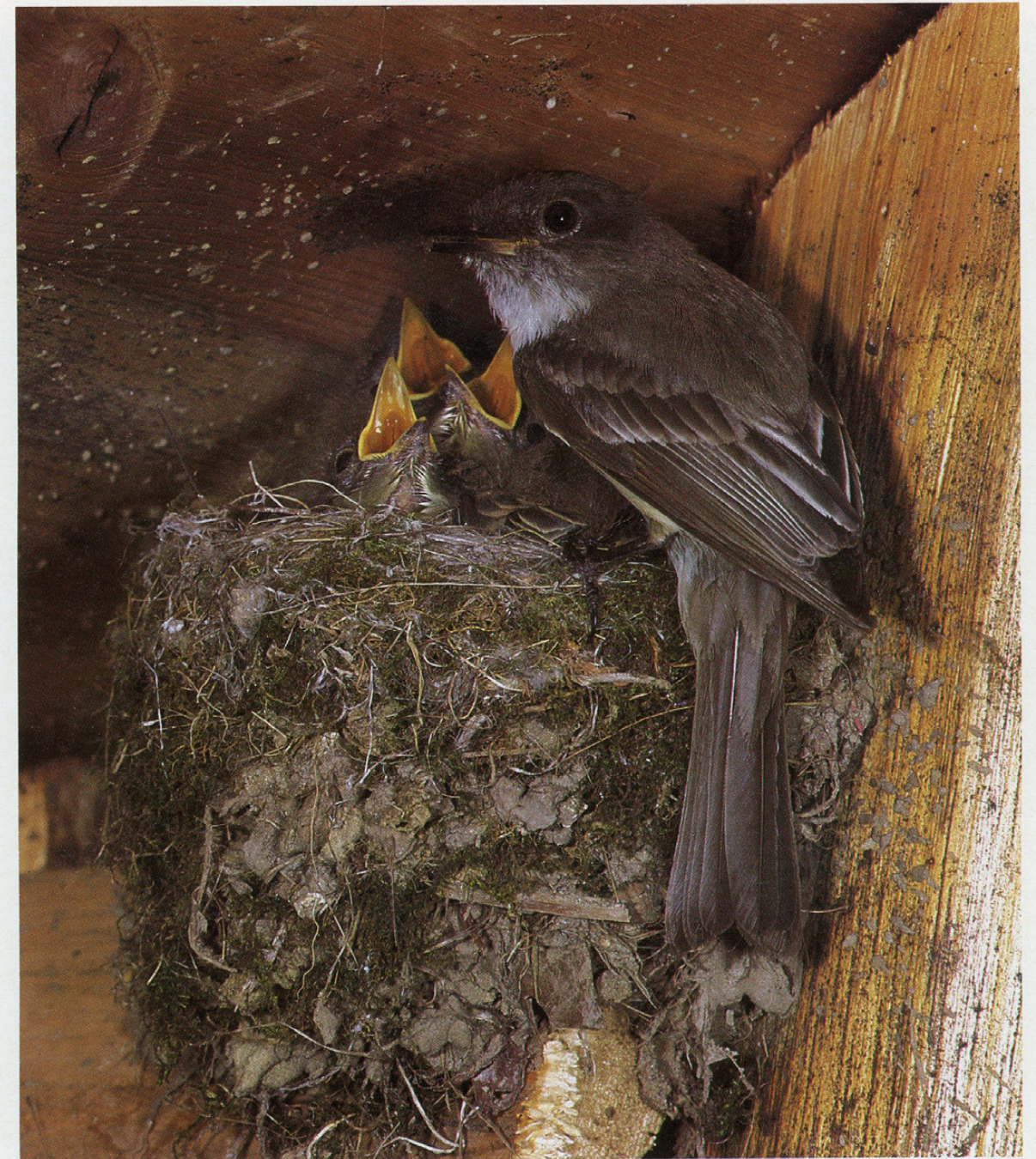
44 EASTERN PHOEBE Sayornis phoebe 1975/IJ