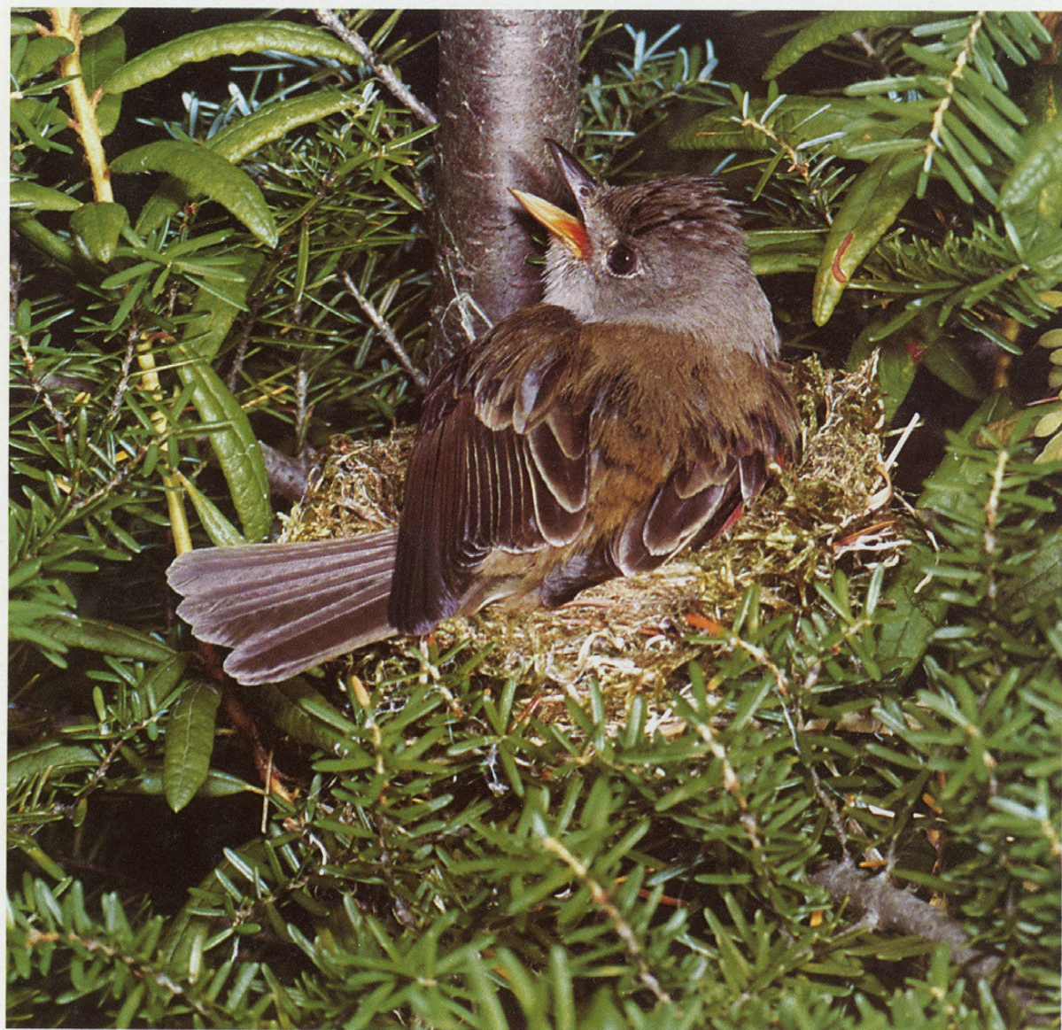
45 WILLOW FLYCATCHER Empidonax traillii 1978/DEW