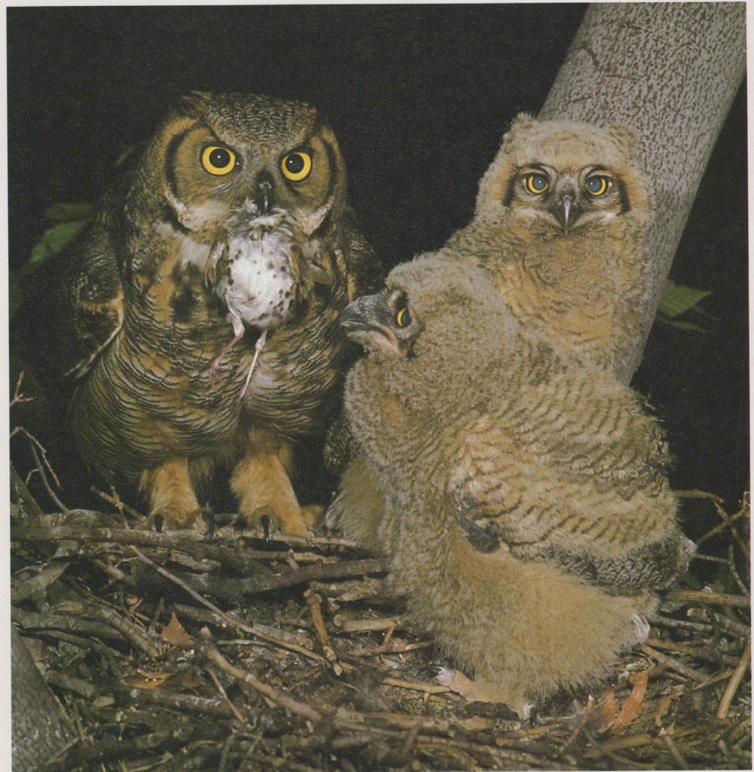
32 GREAT HORNED OWL Bubo virginianus 1980/IJ