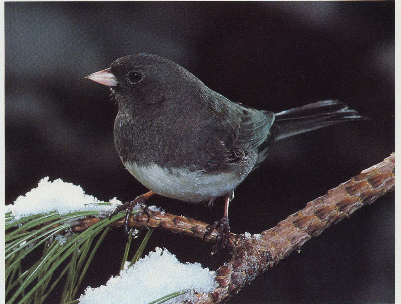
58 DARK-EYED JUNCO Junco hyemalis 1981/IJ