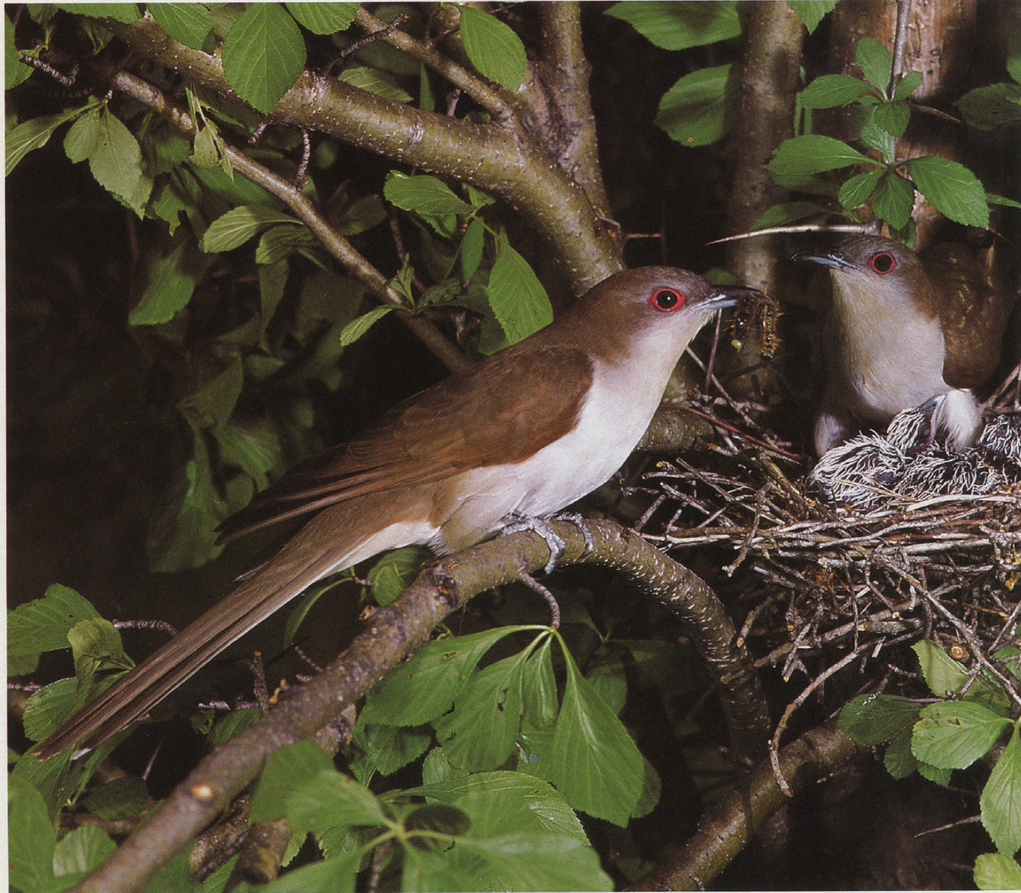
51 BLACK-BILLED CUCKOO Coccyzus erythrophthalmus 1978/IJ