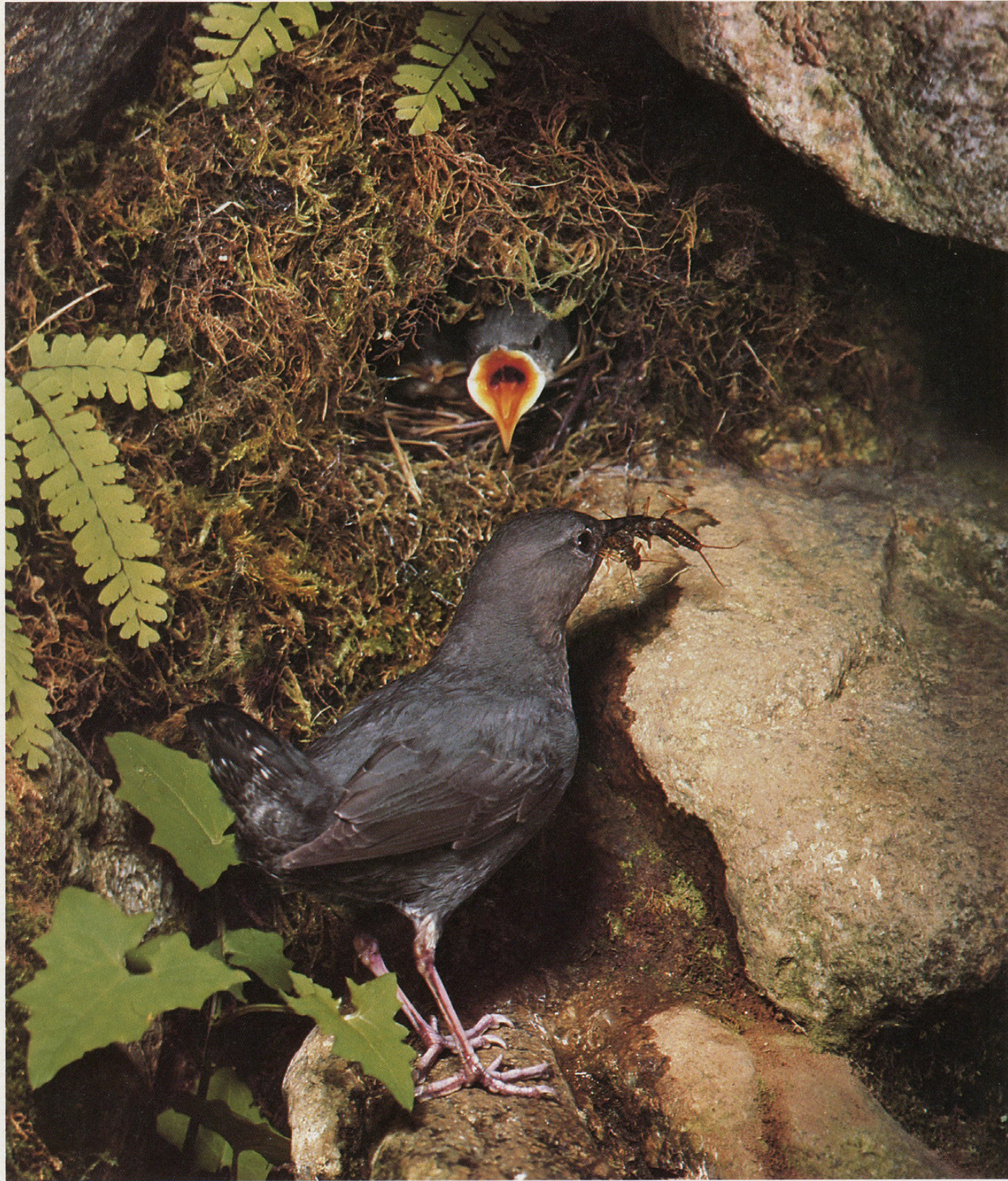
59 AMERICAN DIPPER Cinclus mexicanus 1982/DEW