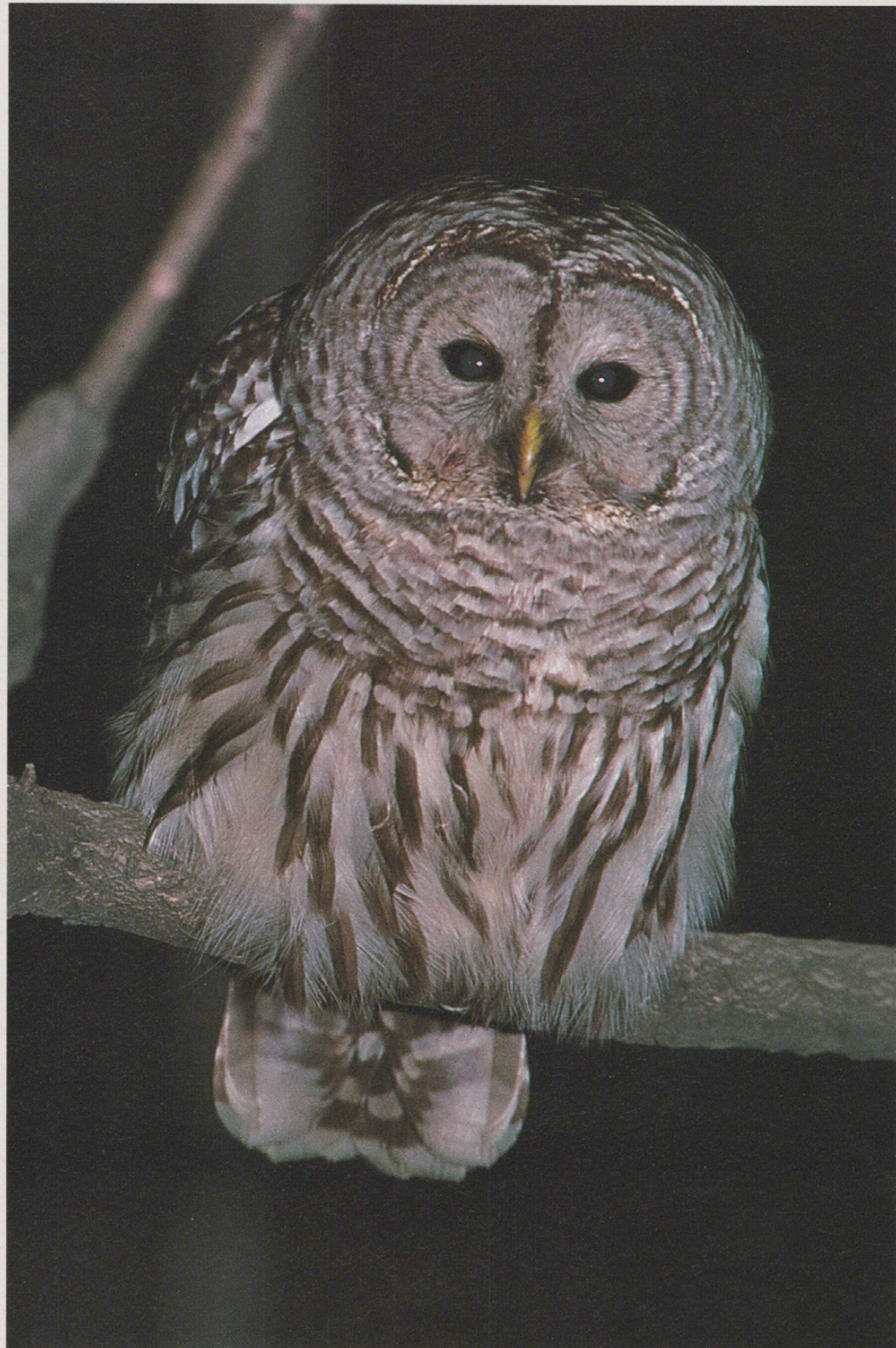
31 BARRED OWL Strix varia 1974/IJ