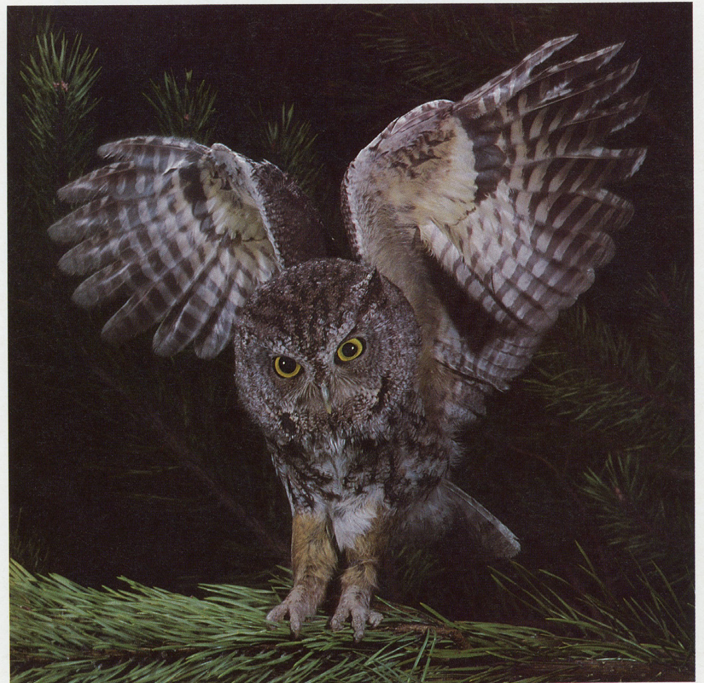
34 EASTERN SCREECH-OWL Otus asio 1977/IJ