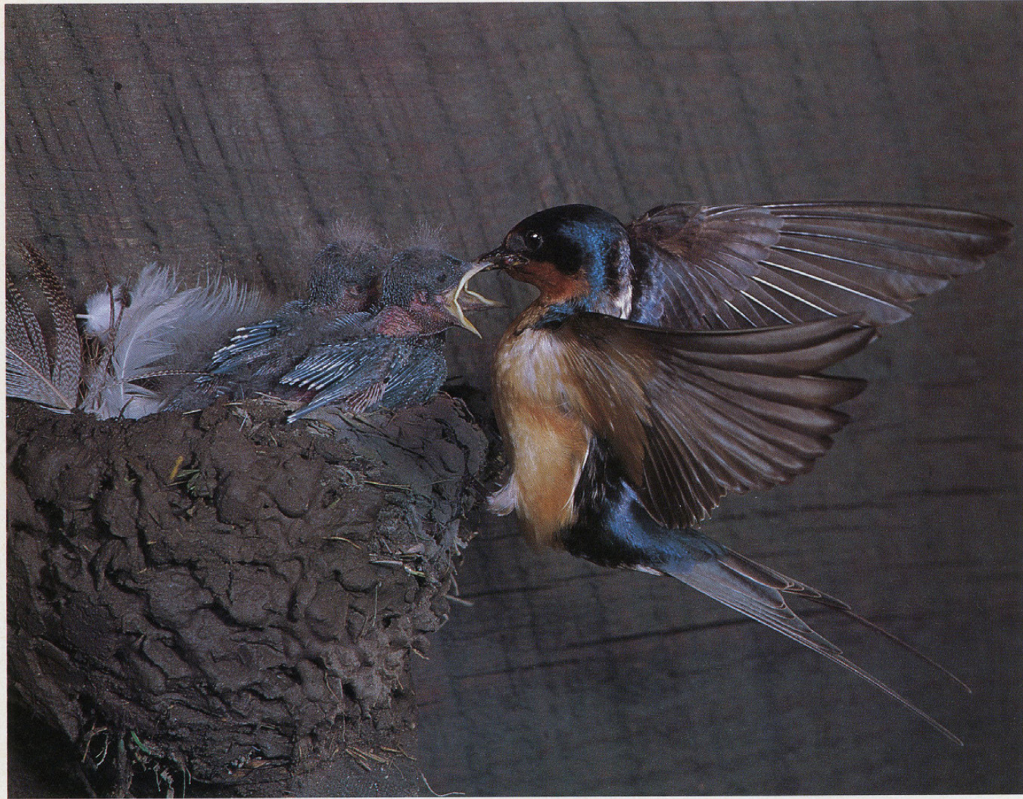
49 BARN SWALLOW Hirundo rustica 1977/IJ