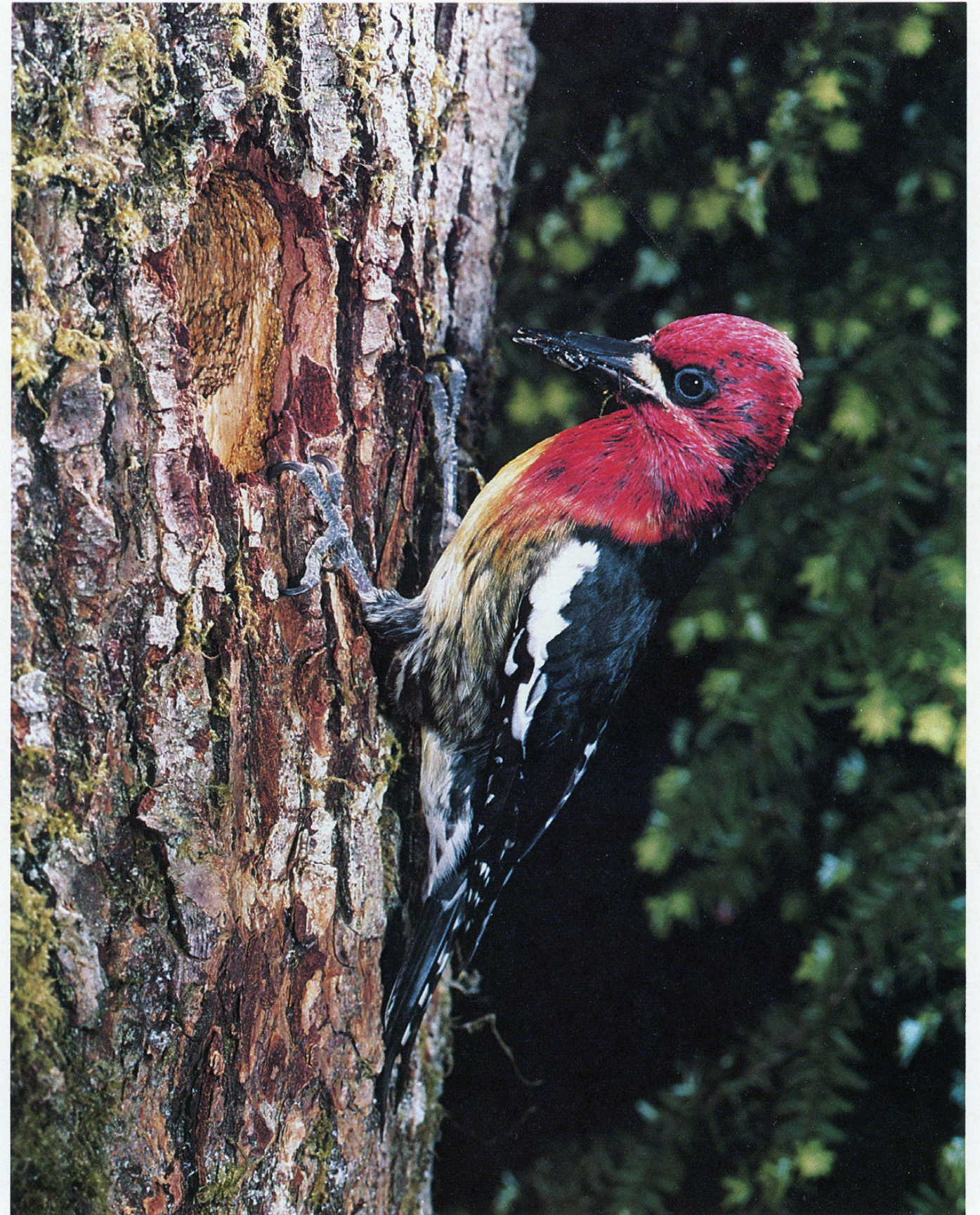
40 RED-BREASTED SAPSUCKER Sphyrapicus ruber 1982/SP