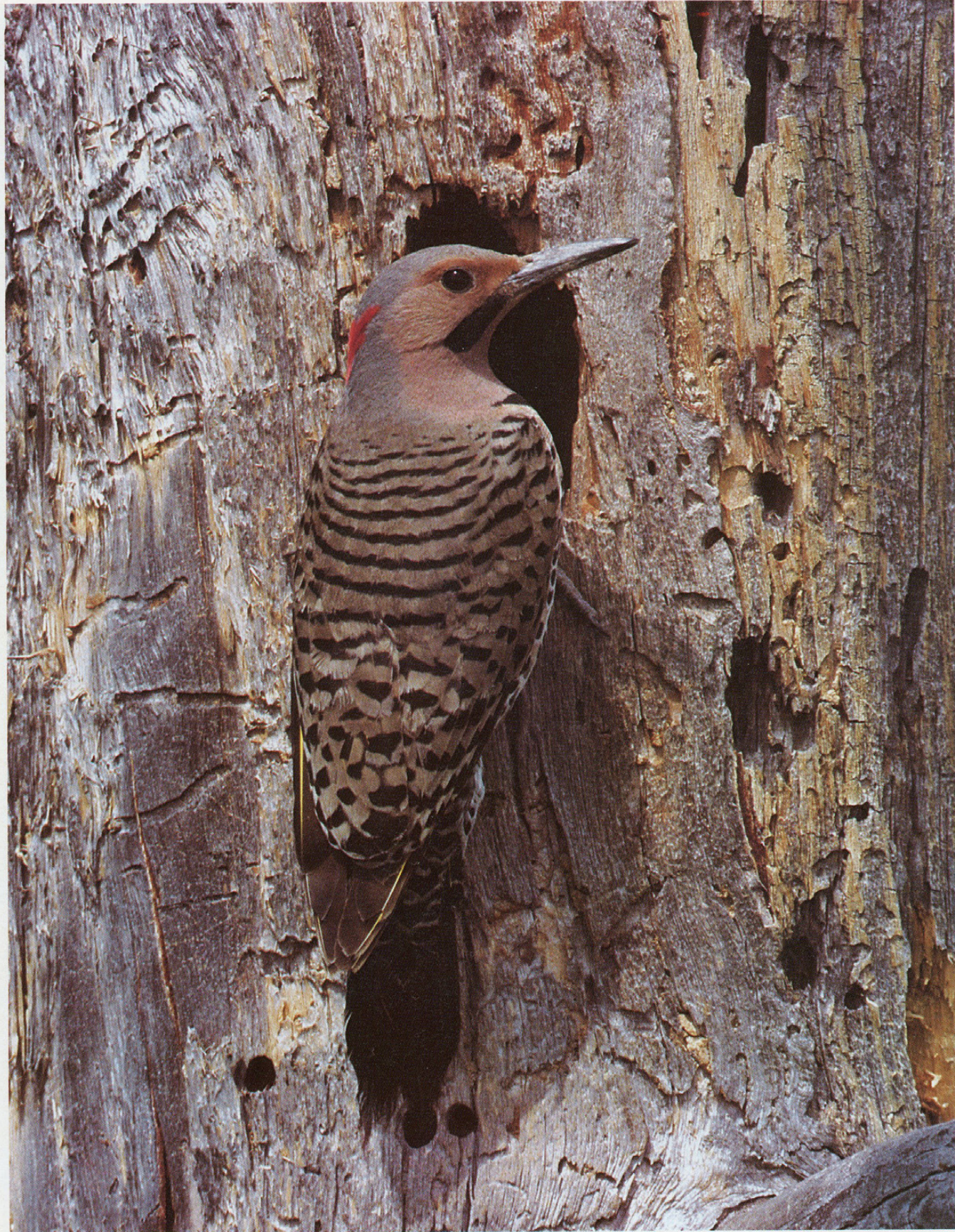
41 NORTHERN FLICKER Colaptes auratus 1978/DEW