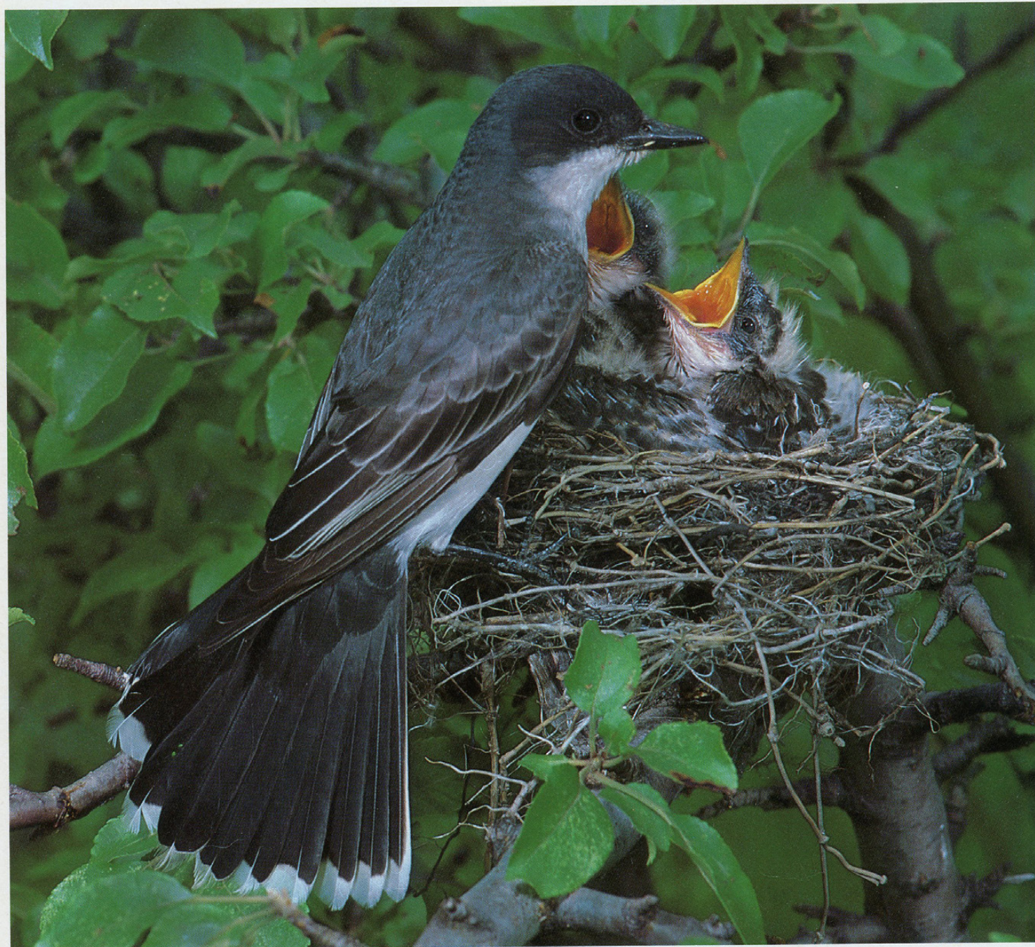
43 EASTERN KINGBIRD Tyrannus tyrannus 1978/IJ