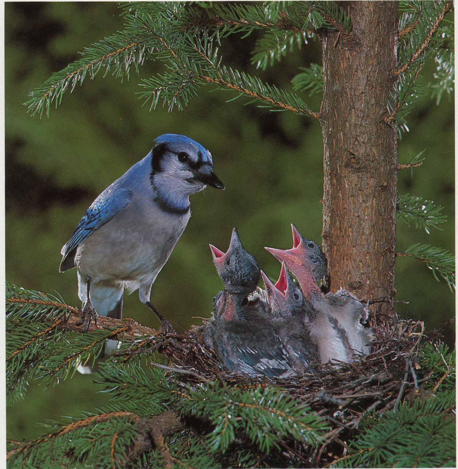
52 BLUE JAY Cyanocitta cristata 1979/IJ