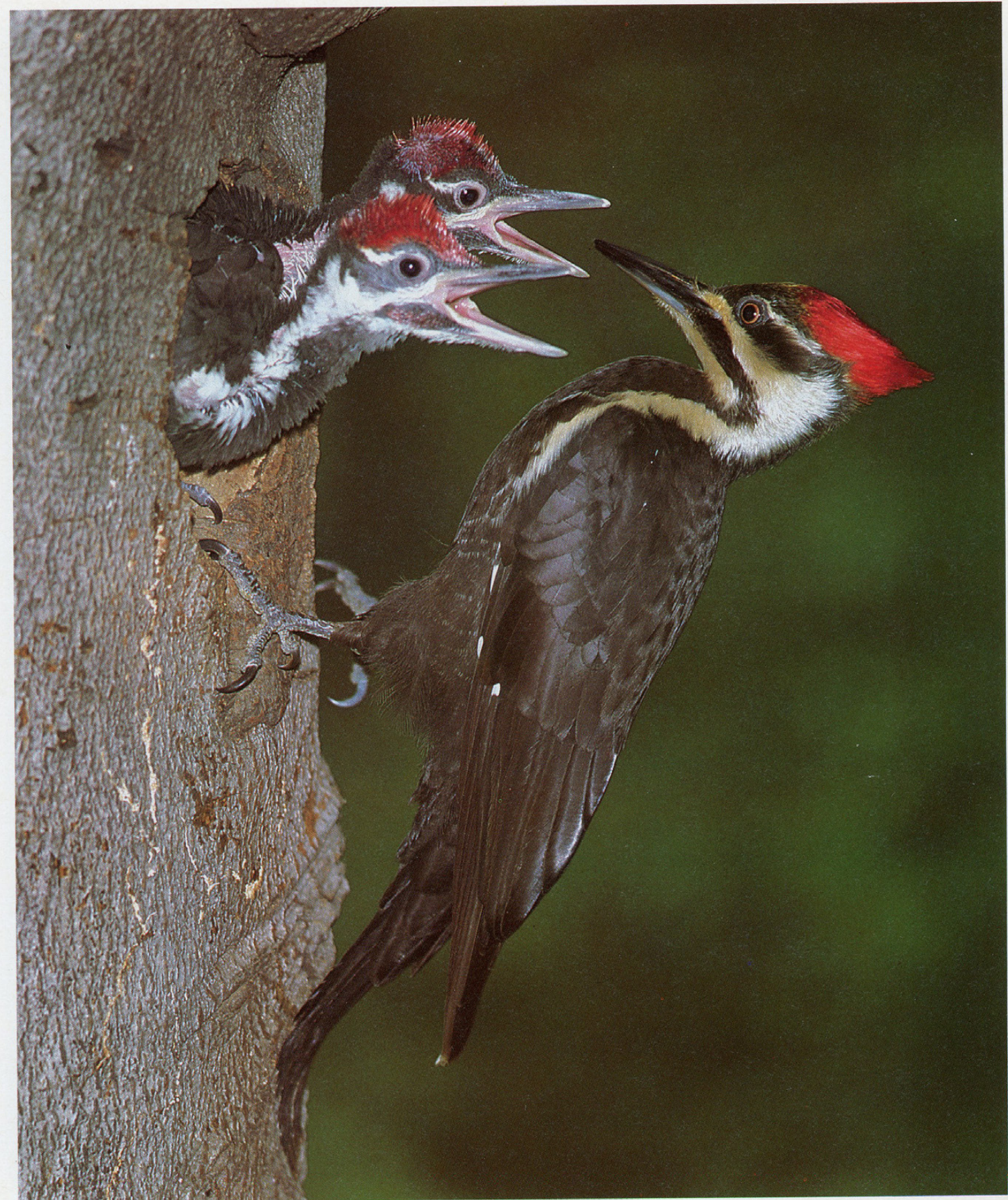
42 PILEATED WOODPECKER Dryocopus pileatus 1983/IJ