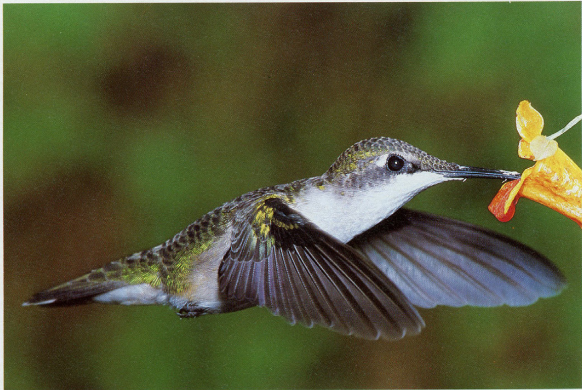
37 RUBY-THROATED HUMMINGBIRD Archilochus colubris 1981/IJ