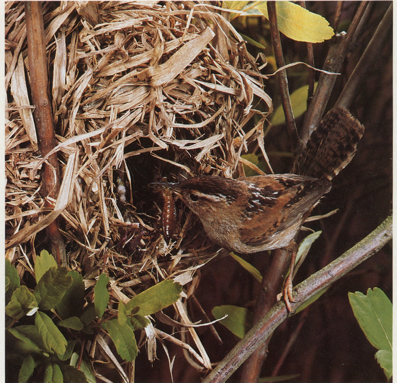
56 MARSH WREN Cistothorus palustris 1983/DEW