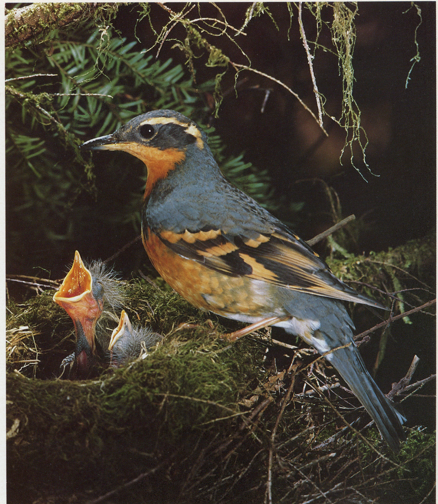
60 VARIED THRUSH Ixoreus naevius 1983/DEW