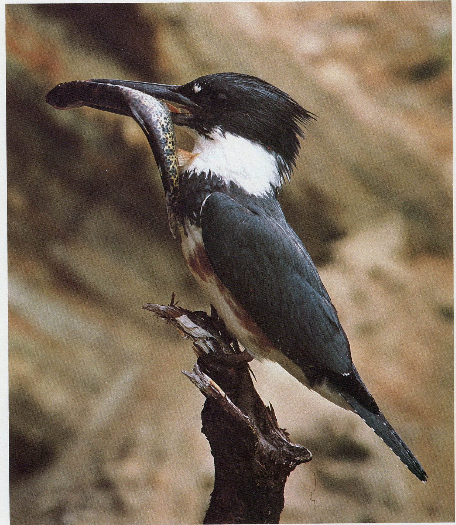
36 BELTED KINGFISHER Ceryle alcyon 1980/DEW