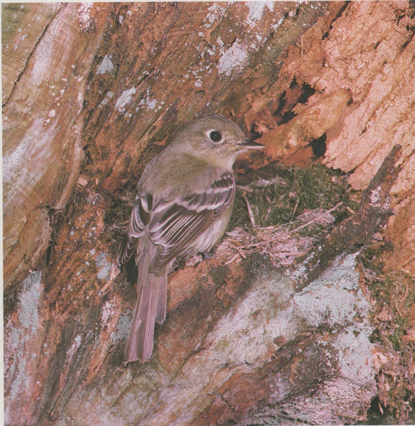
47 WESTERN FLYCATCHER Empidonax difficilis 1978/DEW