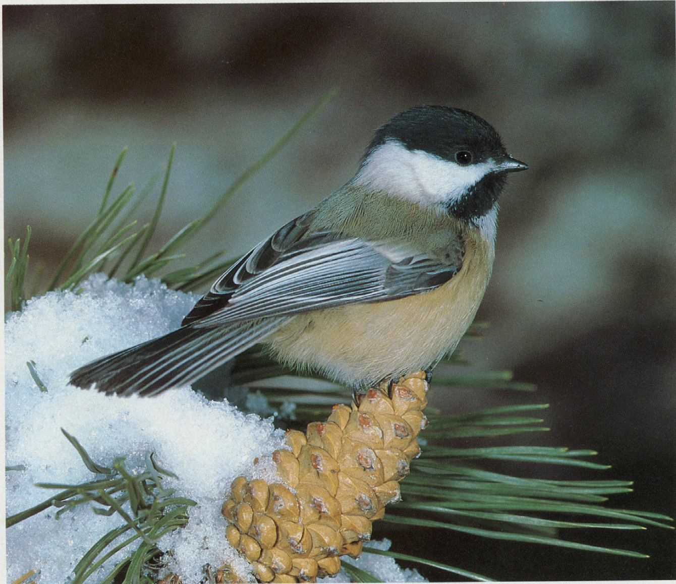
53 BLACK-CAPPED CHICKADEE Parus atricapillus 1982/IJ