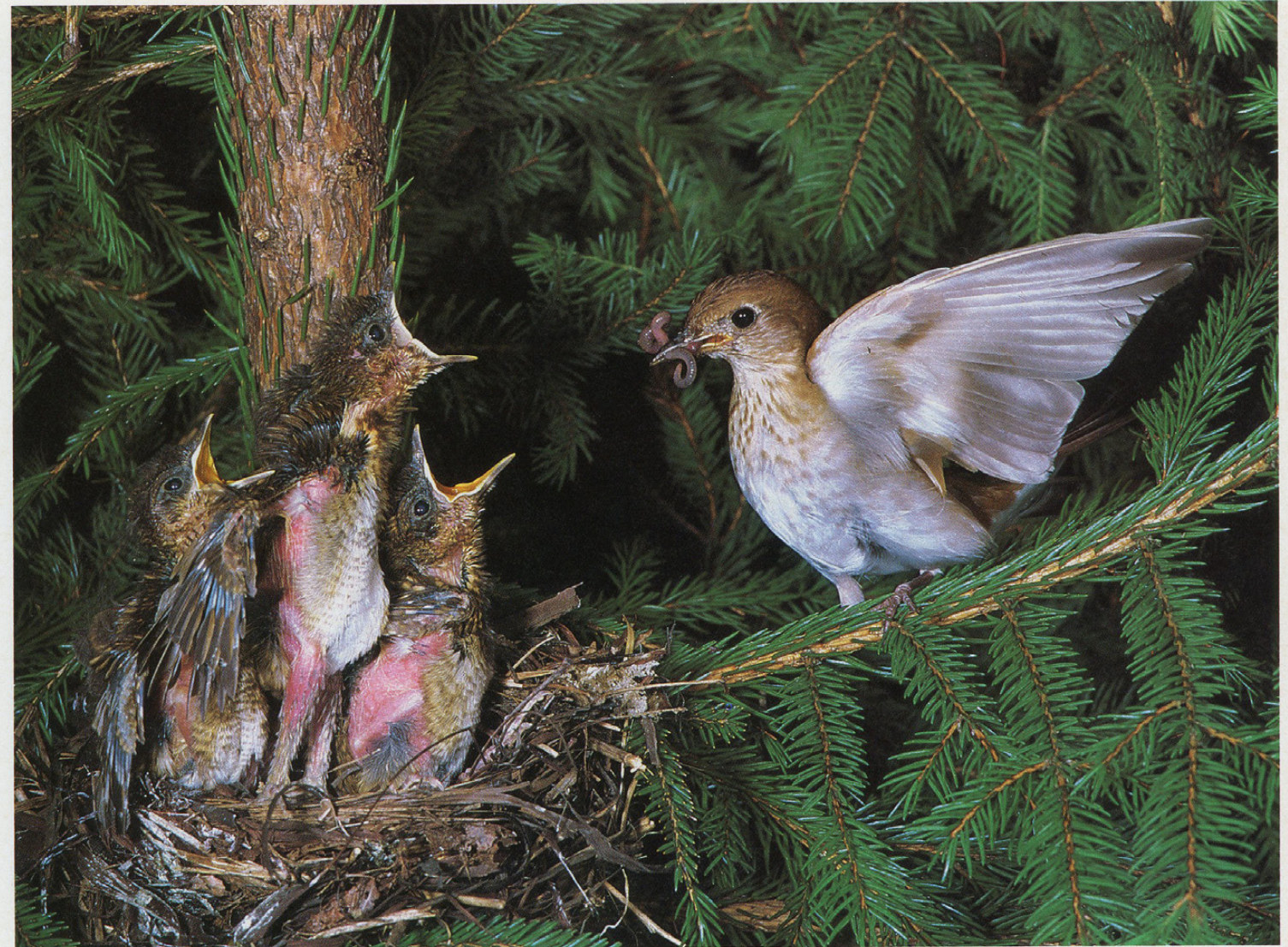
62 VEERY Catharus fuscescens 1981/LJ