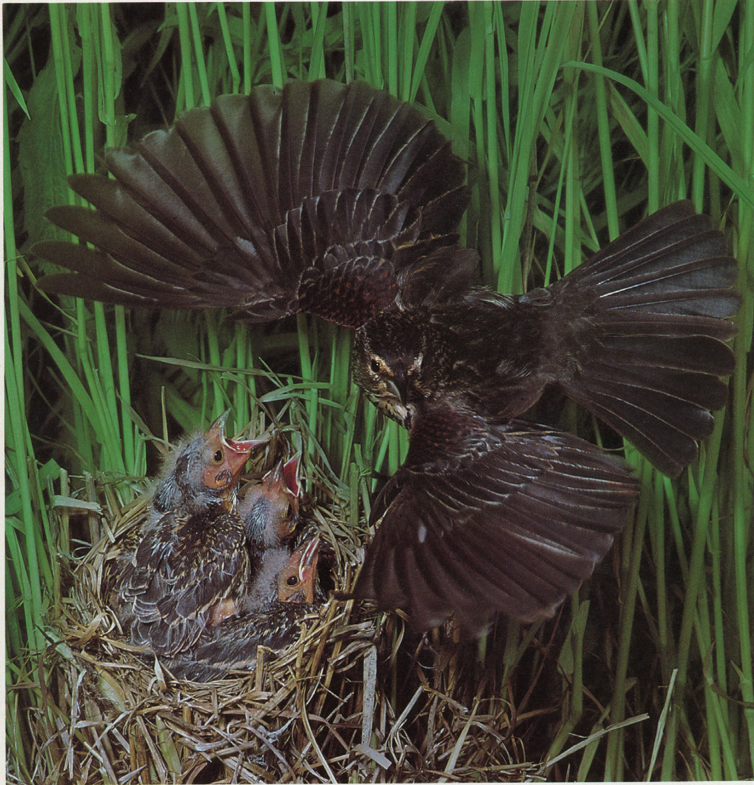
55 RED-WINGED BLACKBIRD Agelaius phoeniceus 1977/LJ