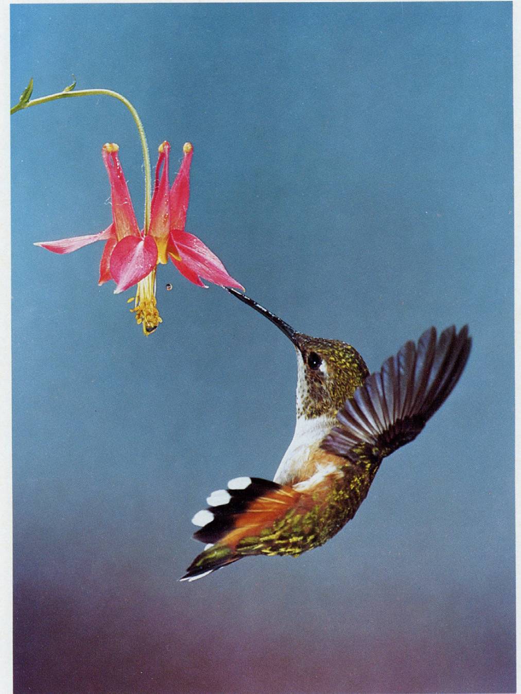
38 RUFOUS HUMMINGBIRD Selasphorus rufus 1983/DEW