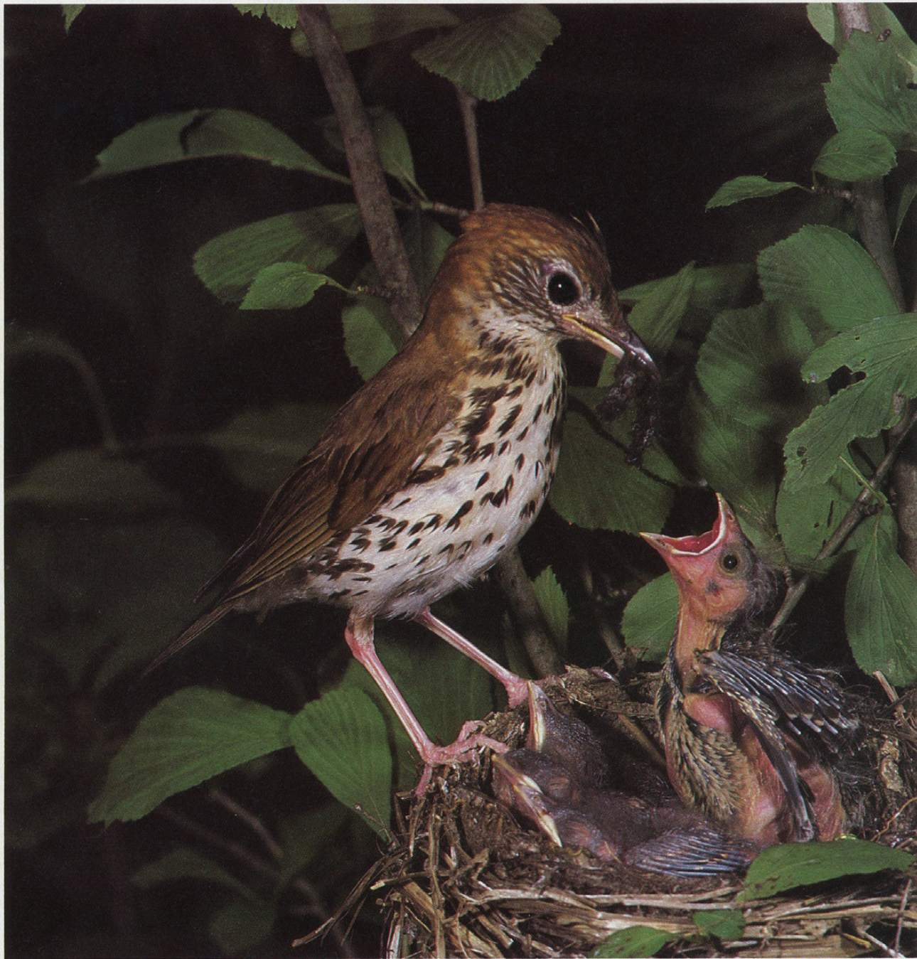
61 WOOD THRUSH Hylocichla mustelina 1978/LJ