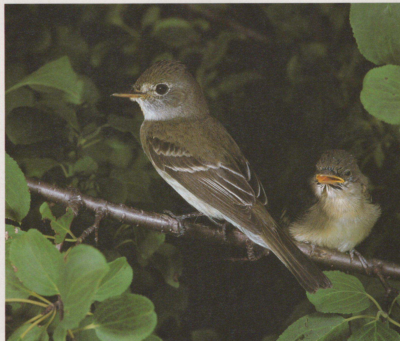
46 LEAST FLYCATCHER Empidonax minimus 1976/IJ