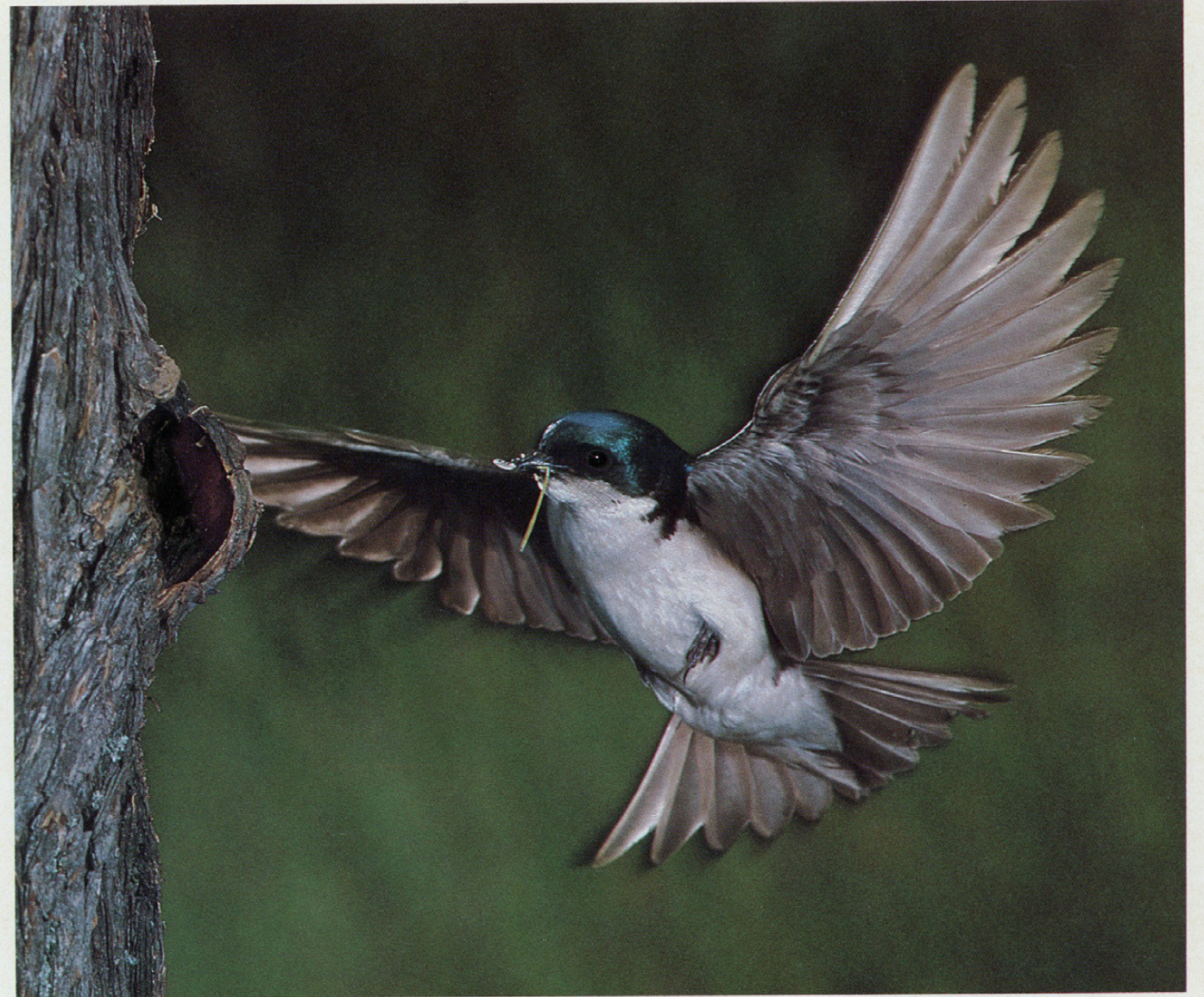
50 TREE SWALLOW Tachycineta bicolor 1981/IJ