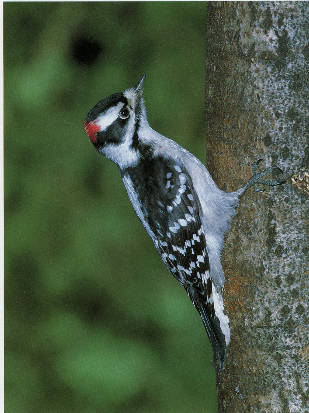
39 DOWNY WOODPECKER Picoides pubescens 1983/IJ