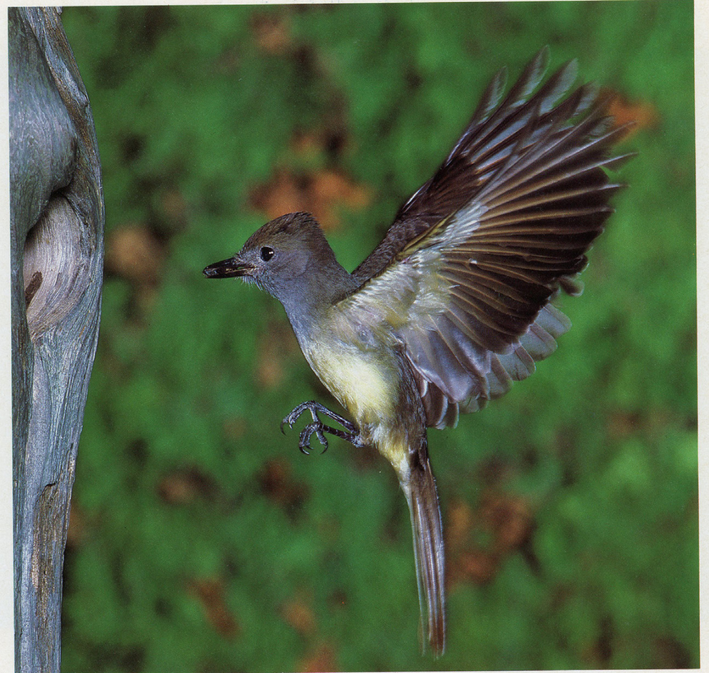
48 GREAT CRESTED FLYCATCHER Myiarchus crinitus 1982/LJ