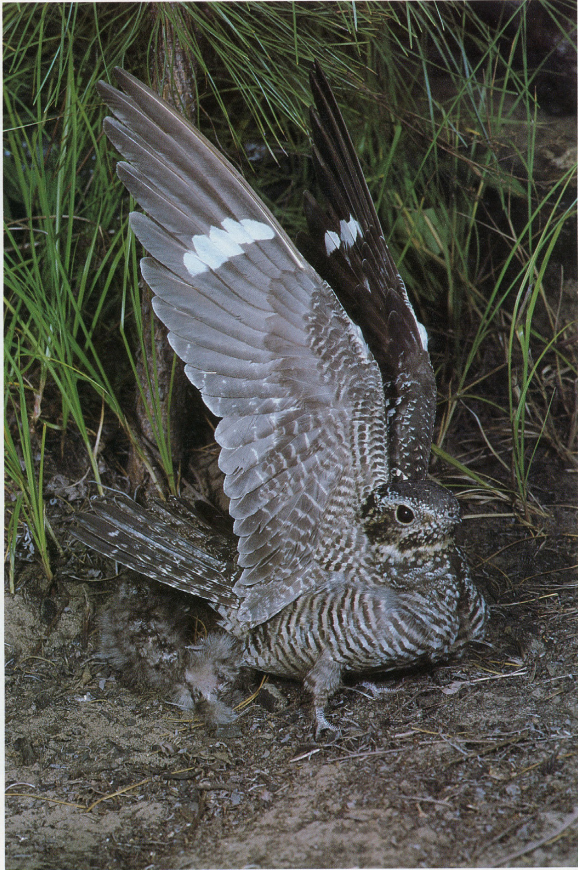
35 COMMON NIGHTHAWK Chordeiles minor 1978/IJ