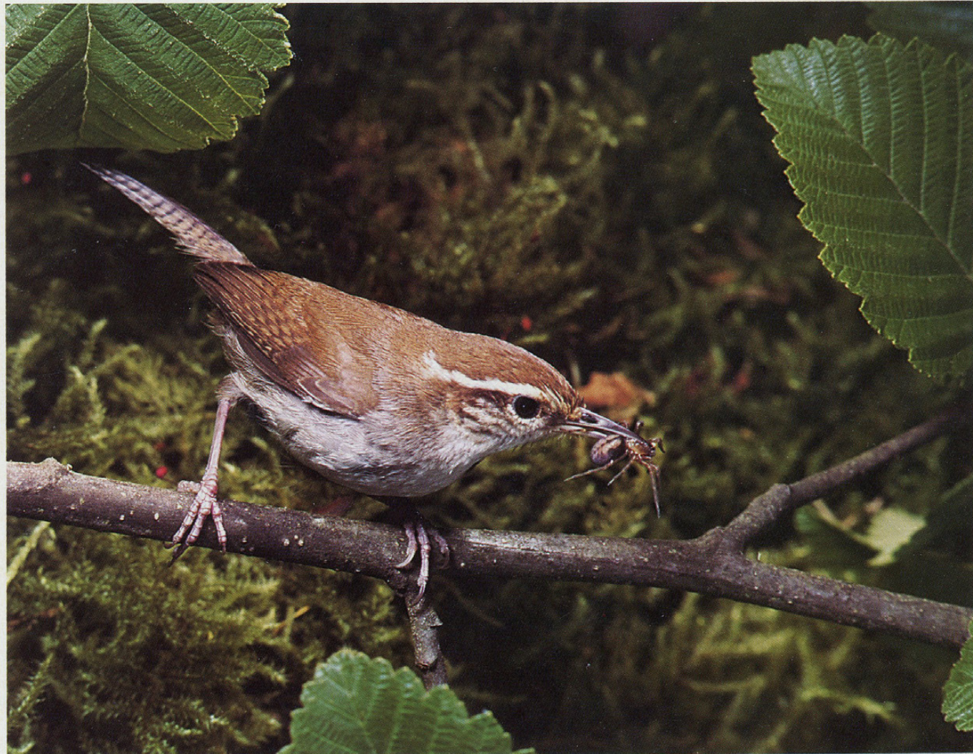
57 BEWICK'S WREN Thryomanes bewickii 1983/SP