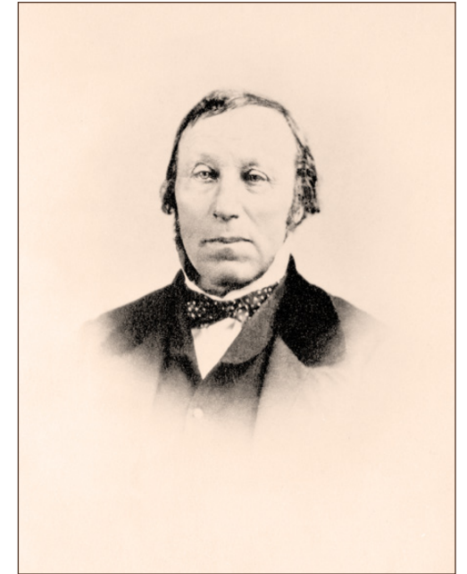
ALFRED WADDINGTON (1801 - 1872)