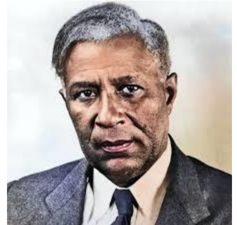
A picture of Garrett Morgan

Beginning in 1337, the 100 Years' War was a grueling conflict between France and England, which spanned for over a century—hence the name. However, there was a brief period of peace that was a result of the uniting of their thrones through marriage. In 1420, at the beginning of the 83 rd year of their dispute, a marriage was arranged between Catherine of Valois and Henry V of England. This marriage gave England an heir to the French throne, temporarily bringing an end to the conflict. Although this marriage was a diplomatic solution to the conflict, some historians will argue that there was more than just politics behind their marriage. Many gestures and public displays of affection that the two made towards each other suggested a deeper, more affectionate side of their marriage. However, after Henry V passed away just 2 years later, and France had regained control of their throne, the war resumed for another 33 years.