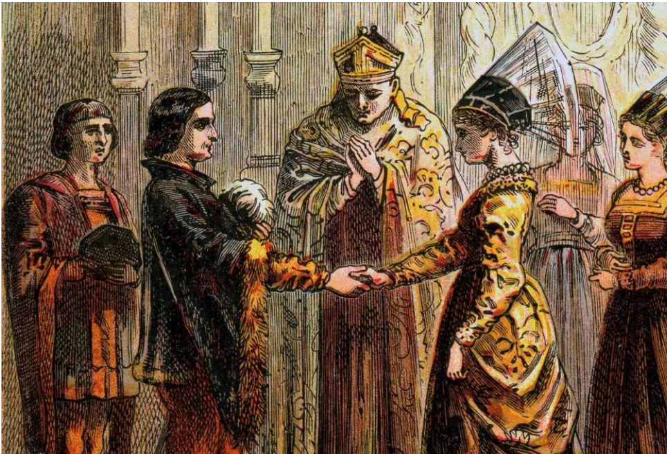
An illustration depicting the wedding of Catherine of Valois and Henry V of England in 1420, artist unknown.