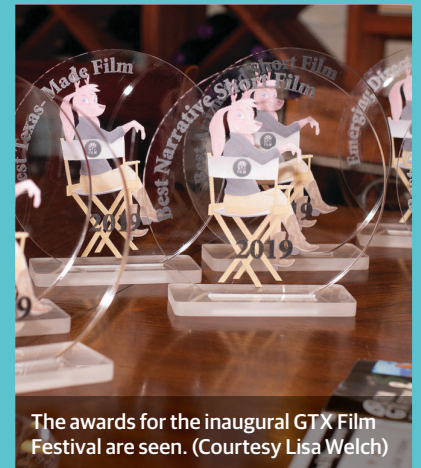
The awards for the inaugural GTX Film Festival are seen.