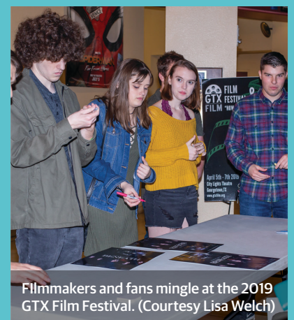
Filmmakers and fans mingle at the 2019 GTX Film Festival.