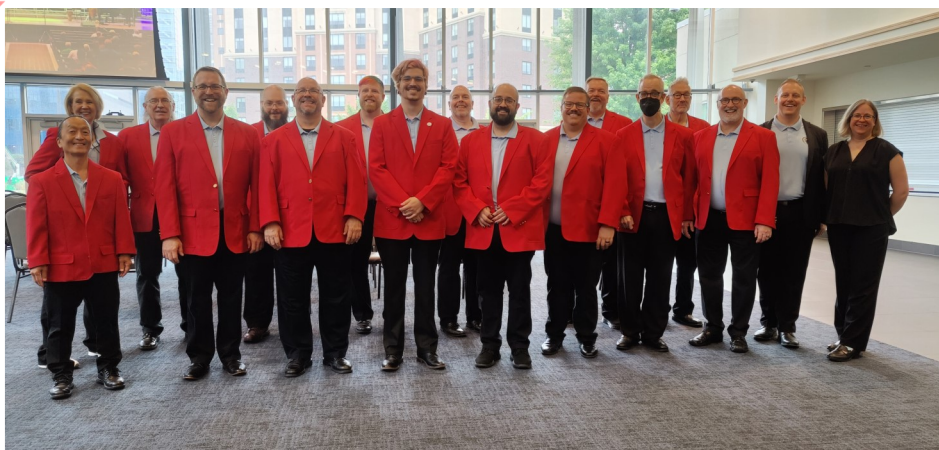
HGMC poses just after leaving the stage at Central Lutheran Church in Minneapolis