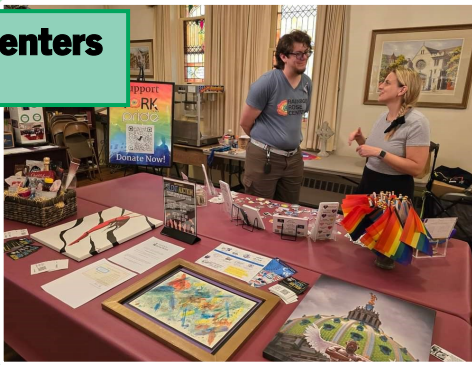
Rainbow Rose Center Presentation Heidelberg UCC, York, PA