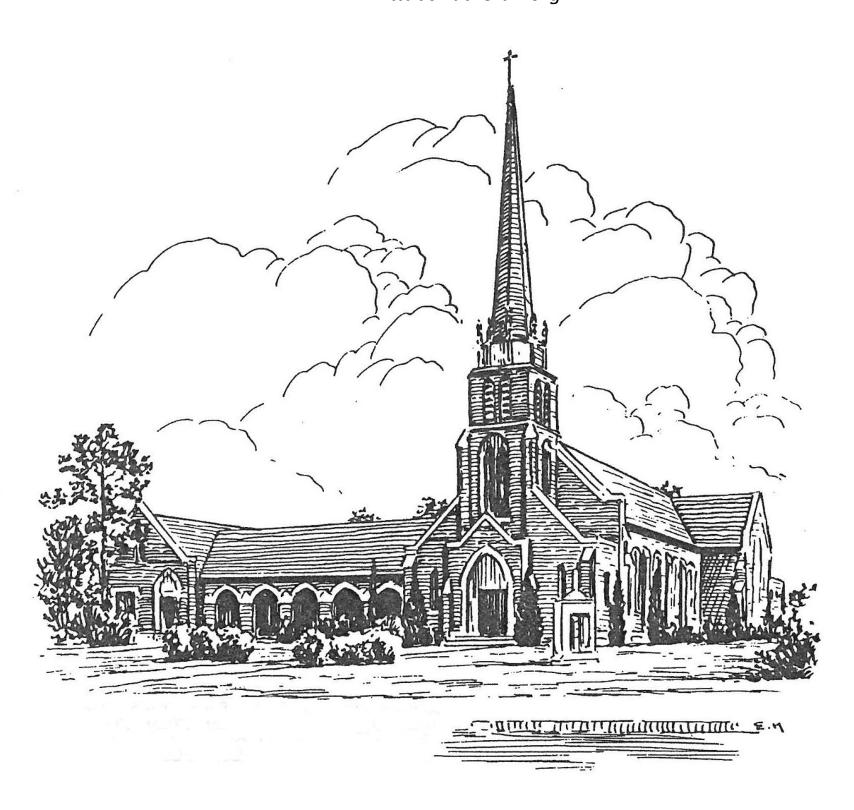
9:15 AM - July 28, 2024 - Tenth Sunday after Pentecost ALIVE! Worship Service

1000 B Avenue · West Columbia · South Carolina · 29169 · 803.796.5948 www.mttaborlutheran.org