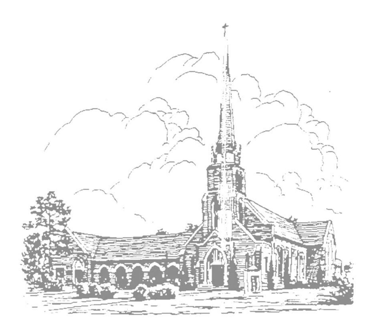
9:15 AM — January 15, 2023 — Second Sunday After Epiphany ALIVE! Worship Service

1000 B Avenue · West Columbia · South Carolina · 29169 · 803.796.5948 www.mttaborlutheran.org