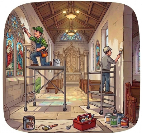
Sanctuary Plaster and Repair Work