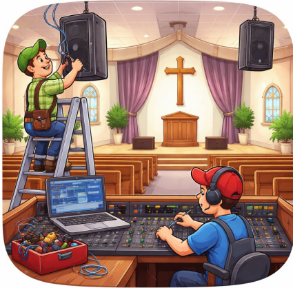
Sanctuary Sound & Video Upgrades