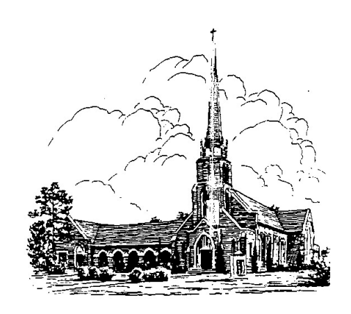
Visit our Website www.mttaborlutheran.org