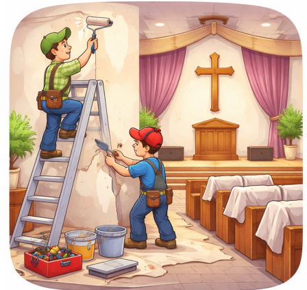
Sanctuary Plaster and Repair Work