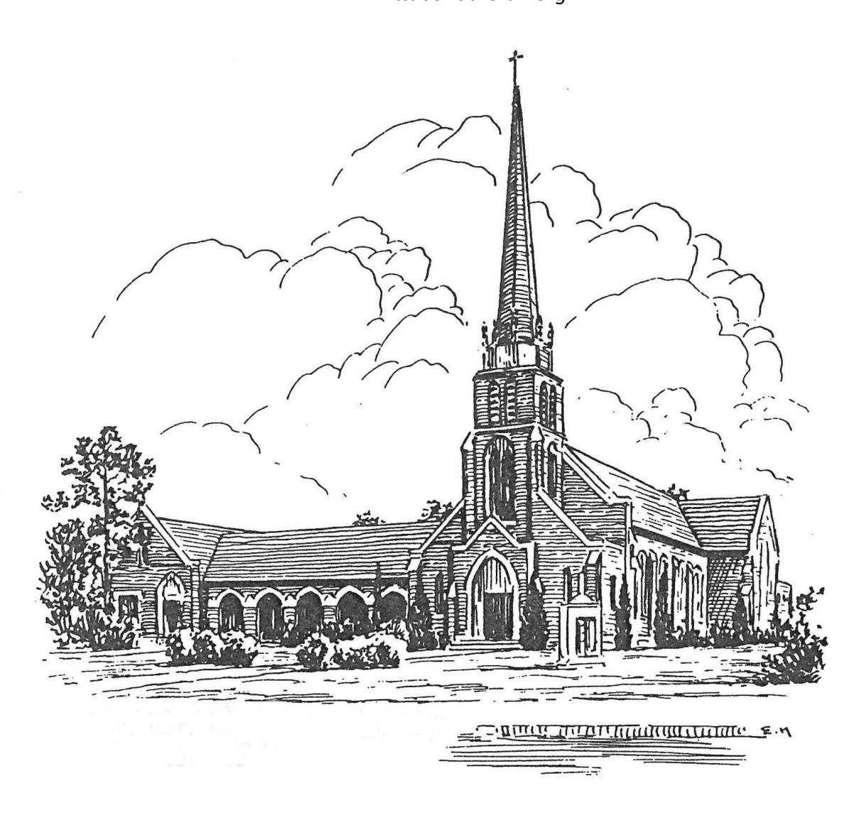
9:15 AM - July 21, 2024 - Ninth Sunday after Pentecost ALIVE! Worship Service

1000 B Avenue · West Columbia · South Carolina · 29169 · 803.796.5948 www.mttaborlutheran.org