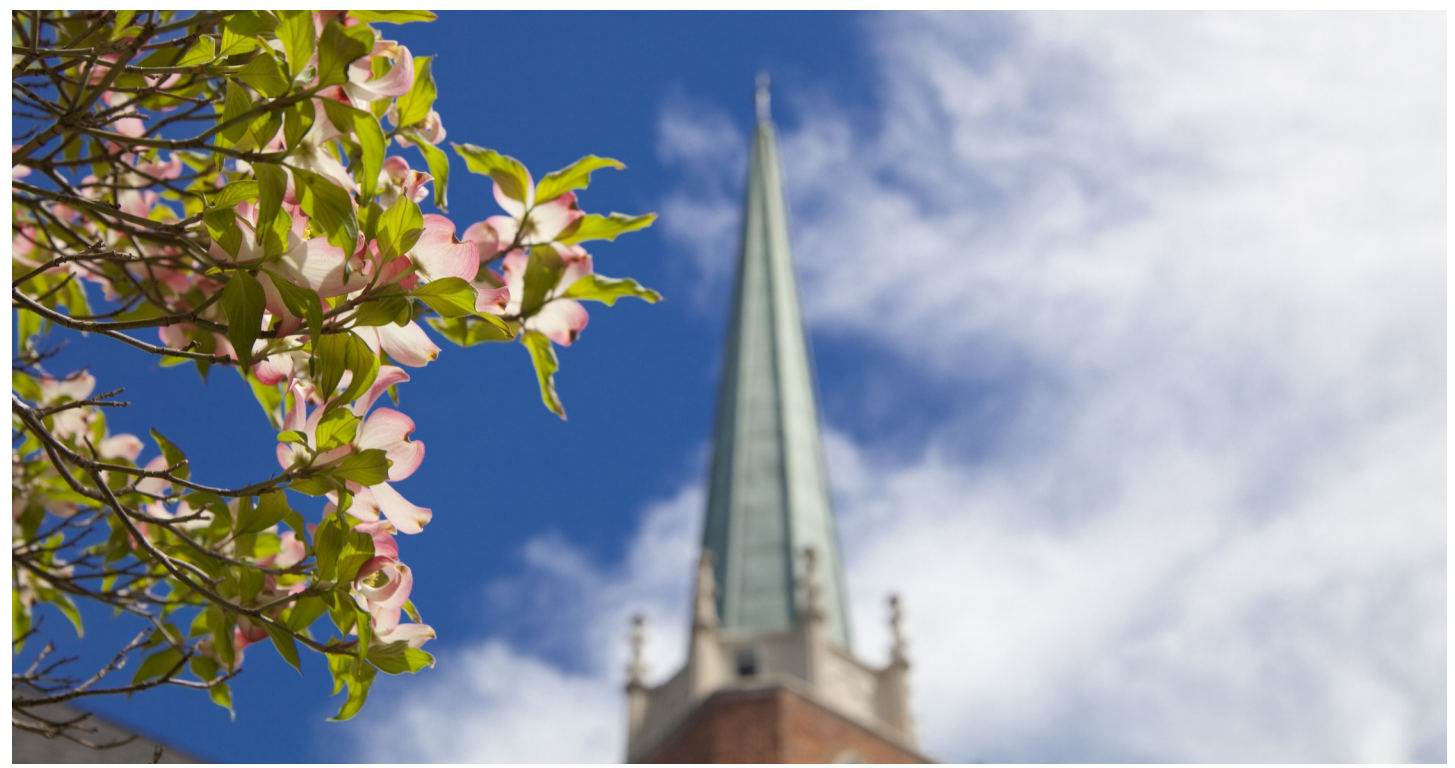
Weddings at Mt. Tabor Lutheran Church