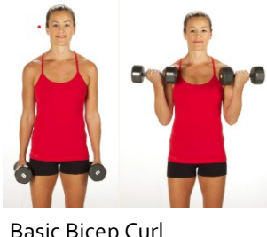
Basic Bicep Curl

Use a small weight or resistance band to build upper arm strength.