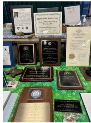
There have been lots and lots of awards over the years!