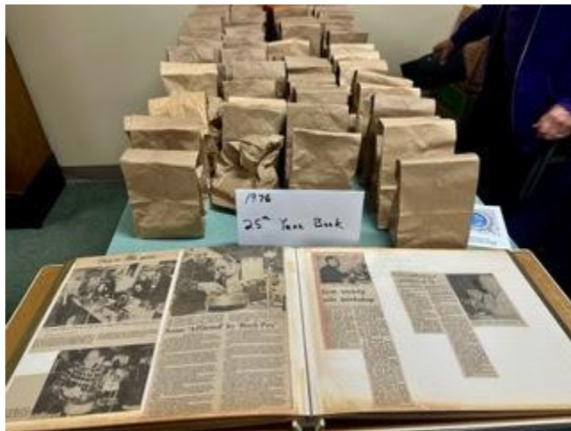
Free grab bags with surprises inside for the attendees. Plus the 25th yearbook.