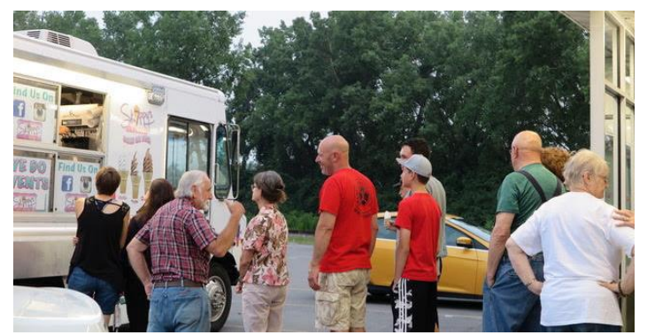
Everybody patiently waited their turn. Cook)