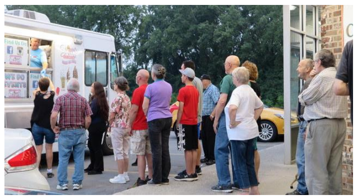
...The Skippy's Ice Cream man showed up!