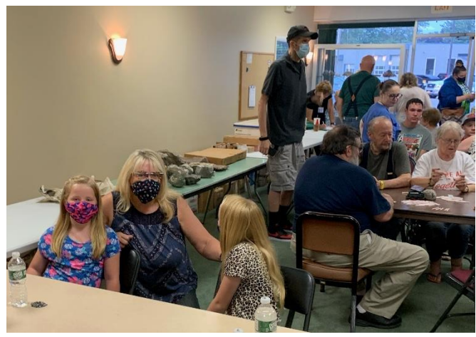
All ages were involved!