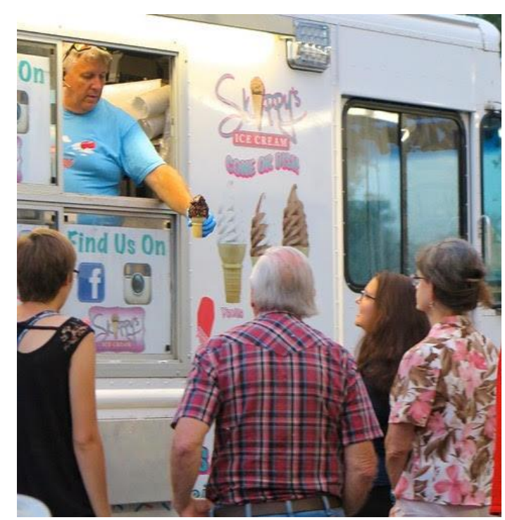
Ah, finally a sweet reward!