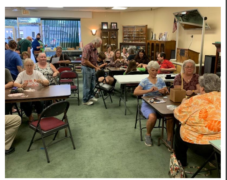
There was some competition between tables on who could get and fill more straws.

A big "Thank You" to all of you who helped get ready for our show.