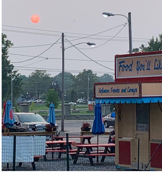
And, as the red sun (caused by CA fires) set slowly in the west...