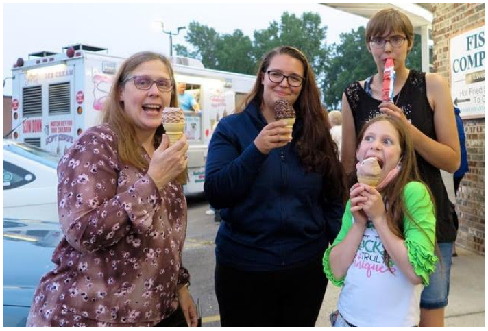
Enjoying their delicious treats!