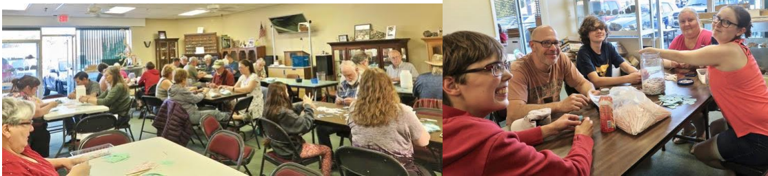
June July