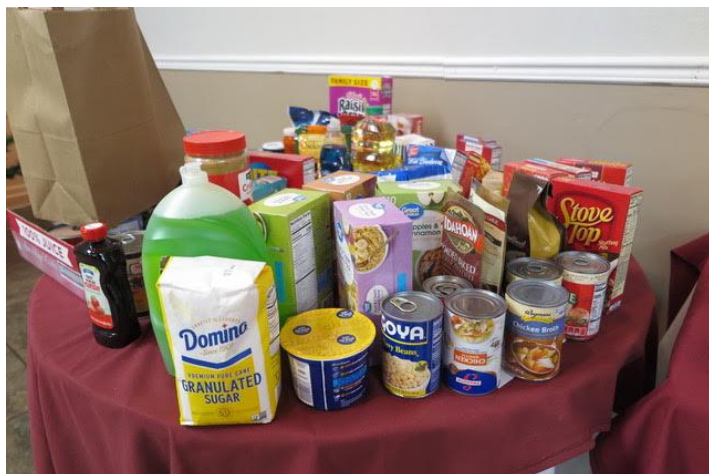
And there were donations for a food pantry, too!