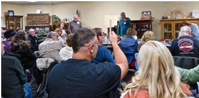
Nov. 21, 2022 Auction Photo Review- Pages 4 - 5