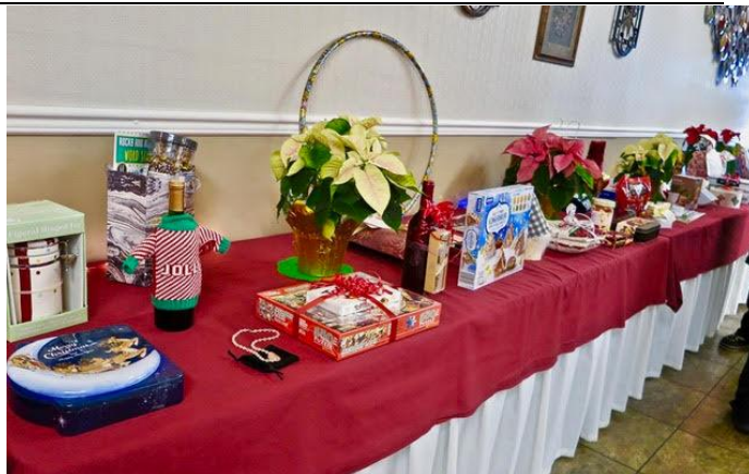
Plus, gifts for the attendees to grab.