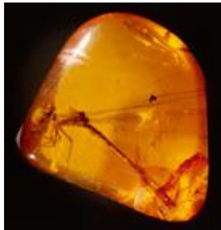
Damselfly in Dominican amber, L: 4.6 cm (1 1/2 in.). Private collection.