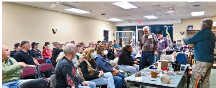
A great crowd was anxiously in attendance!