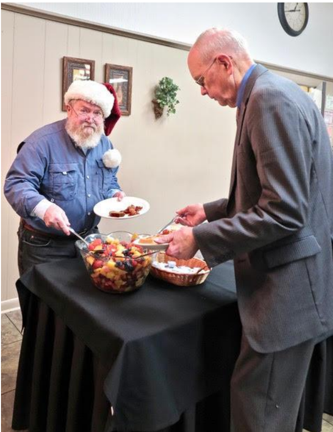
A couple of hungry men!