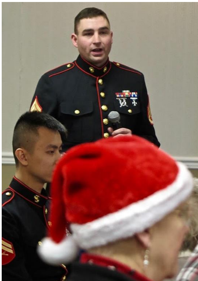
The Marines were there to express appreciation for our donations to Toys for Tots.