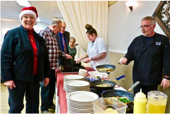
Look who's at the front of the line.