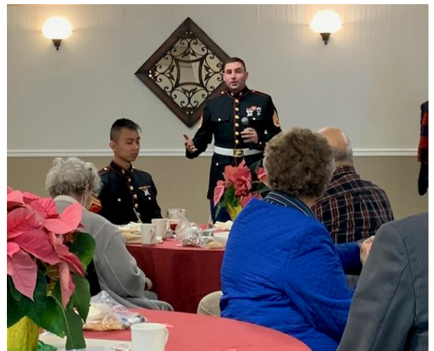
Dec. 11 Holiday Party Photo Review – Pages 6 - 8