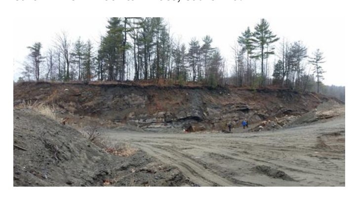
Mill tailings from mining activity at the Cheever Mine, Essex County, New York.

That thorium, however, makes mill tailings easier to locate by airplane surveys since natural, low-level radioactivity can be seen on the images, Shah explained. The airplane surveys were also helpful for detecting the iron ore bodies themselves because the iron is contained in highly magnetic crystals of magnetite. By measuring subtle variations in Earth's magnetic field from the sky, the researchers created 3D models showing the size and shape of the deposits beneath Earth's surface. In addition to mine tailings in the Adirondacks, the USGS is looking into rare earth element occurrences elsewhere in the country, such as in clays in the Southeast or phosphate rocks throughout the U.S. Efforts to map rare earth-bearing formations are also ongoing at the rare earth mine in Mountain Pass, California.