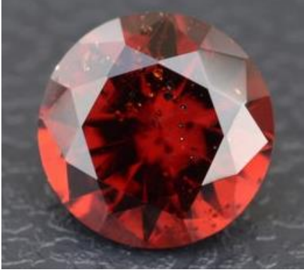
New York garnet, precision cut

The gemstone can be used in all types of jewelry, including rings, earrings and pendants. It can be polished into cabochons and beads for necklaces and bracelets.