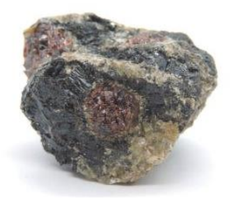
Almandine garnets in matrix

We start this new feature with the state gemstone, garnet. It is also the birthstone for January, but that's another series.