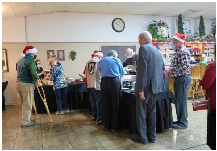
Everybody was so anxious to get to the food table, they pushed the poor crippled kid to the side!