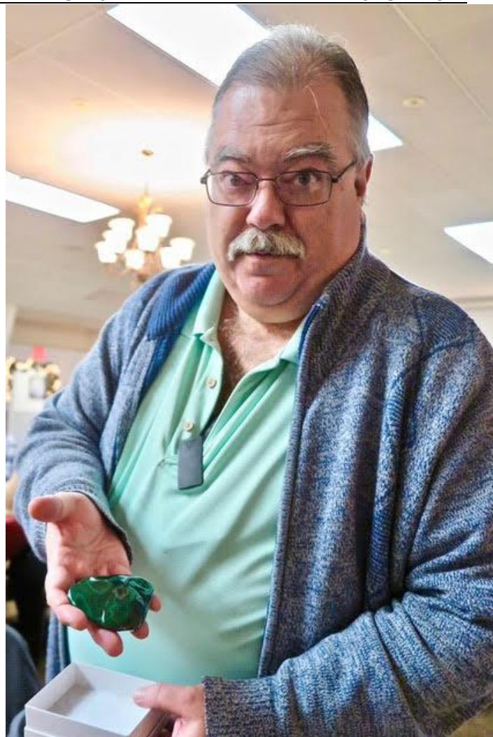
And just where is that specimen from?