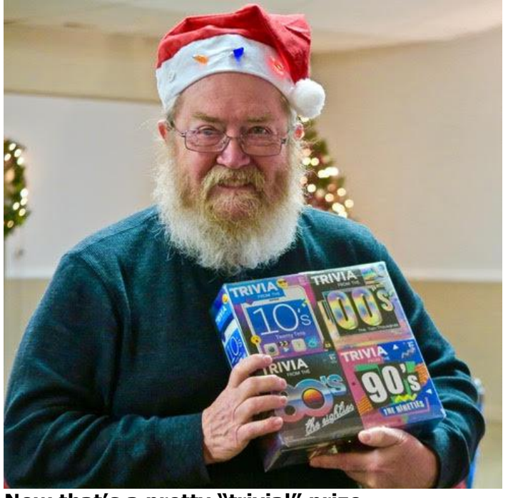
Now that's a pretty "trivial" prize.