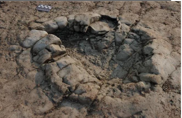
One of the prints found on a beach in Wales.

London (CNN) Footprints discovered on a beach in Wales are believed to have been made by an early dinosaur more than 200 million years ago, experts say. Paleontologists at London's Natural History Museum said the footprints, which date back to the Triassic period, were thought to belong to a very early sauropod or sauropod relative.