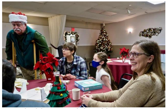
Every had fun around the tables.