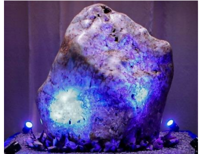
A 683 pounds heavy natural corundum blue sapphire is on display at a residence in Horana, about 25 miles south of Colombo, Sri Lanka, Sunday, Dec. 12, 2021.

by Associated Press Monday, December 13th, 2021