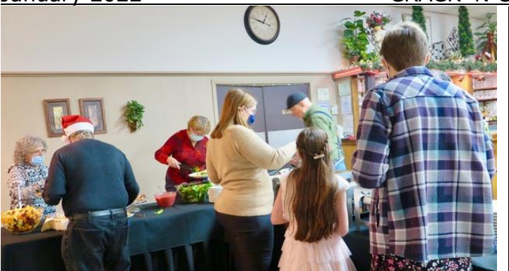
There was plenty of good food to eat.