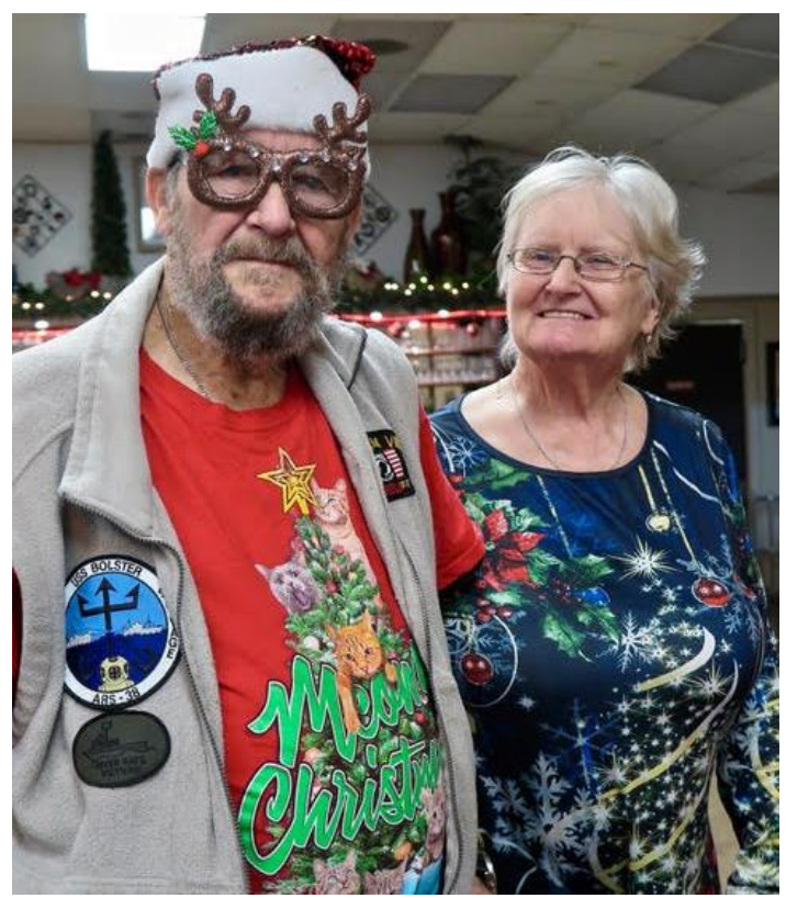
And here are a couple of properly and fashionably dressed couples!