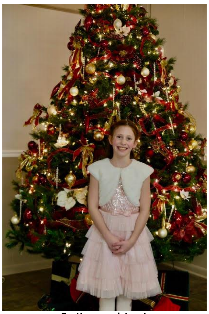
Pretty as a picture!

December 19, 2021 at Bella Domani