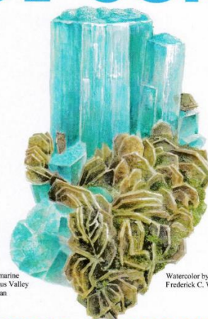
Aquamarine Shengus Valley Pakistan