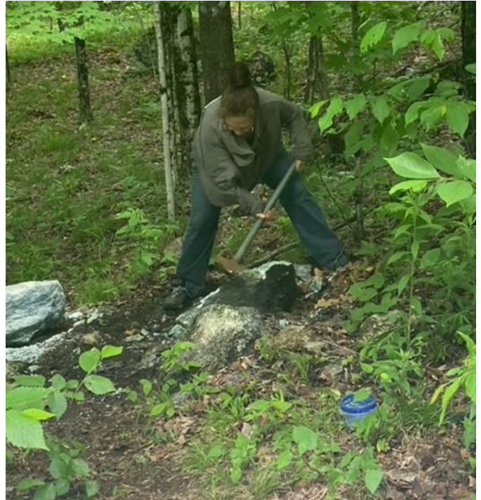
Some pretty nice sledgehammering!