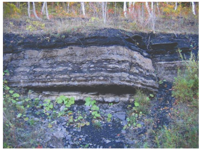
Marcellus shale in Central New York showing Cherry Valley limestone.

In honor of (or in memory of?) our GemWorld show, and its theme of "Fossils of New York," we'll feature some rocks related to that topic. - Editor