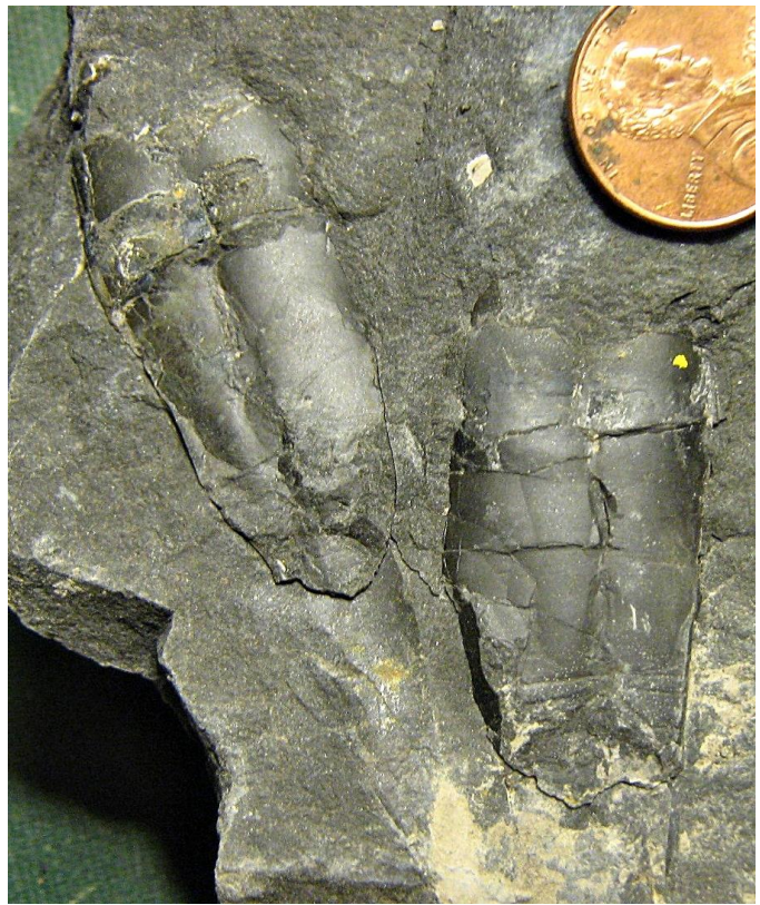
Middle Devonian Natuliod pieces from Marcellus shale, Madison Co.

One thing that sets sedimentary rocks apart from igneous and most metamorphic rocks is the possibility to find fossils in them. Mudstones and shales are good candidates for finding animal remains, shells and plant-part fossils, especially when associated with coal deposits. With these fine-grained rocks, flat objects like leaves can be preserved in detail. Other fossils that can be found are brachiopods, bivalve mollusks, gastropods, trilobites and graptolites.