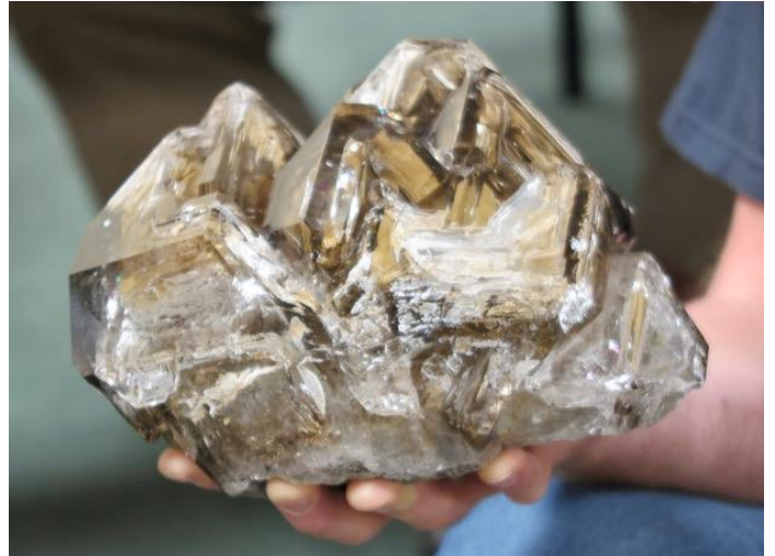
This one is "Medusa."