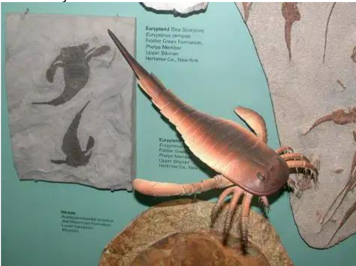
New York State Museum (Albany) display of sea scorpion ( Eurypterus remipes ) fossils and model; photo by Steve Lew on Flickr (noncommercial use permitted with attribution / share alike).

This specimen is from the Susan Sharp Collection (Photo by Judy Cook) official state fossil of New York in 1983. Eurypterids are very rare fossils worldwide; New York State is one of only a few places in the world where they can be commonly found.