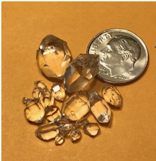
Best Finds of the Day