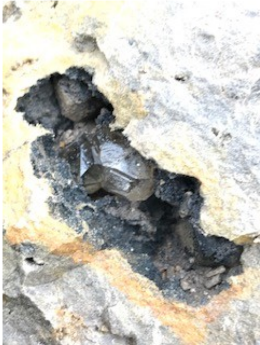
nice little pocket